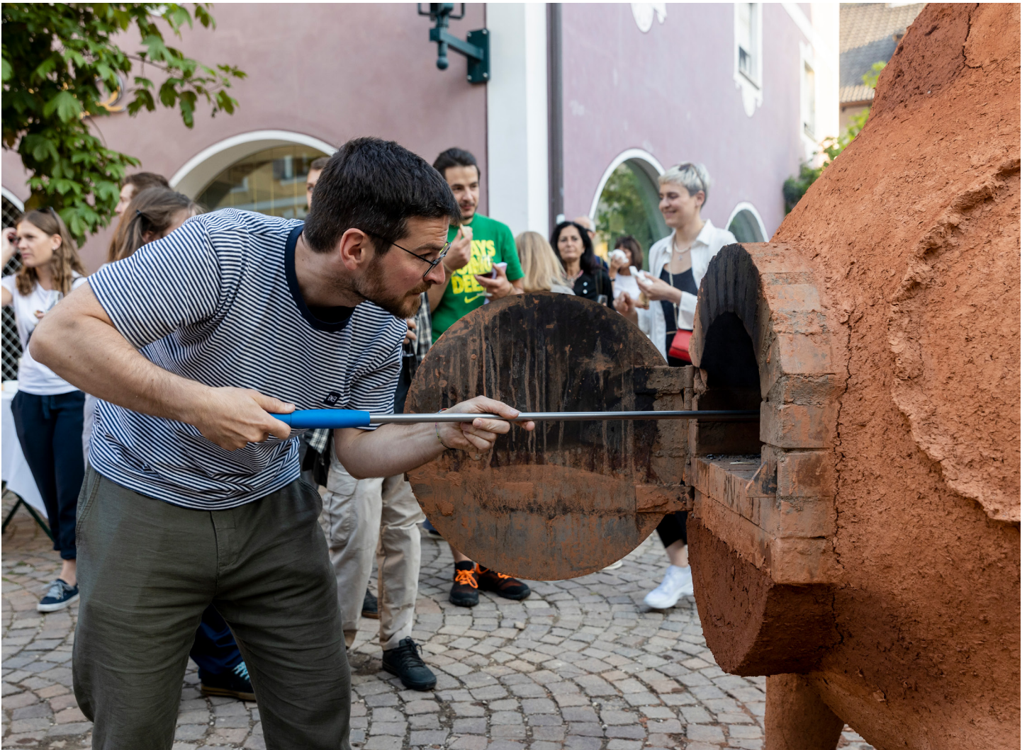
Bread Baking Ceremony, 2022; installation view of Piazza Sant'Antonio, Ortisei; commissioned by Biennale Gherdëina, 2022.

GC: This is not something that I get asked often because it's not necessarily evident when you see the work in the context of an exhibition, yet there is always community involved. The only moment when I work alone is when I'm making the initial drawing for the sculpture, but afterward it is important for me to work with others. I love the back and forth of discussing ideas, particularly while everyone's sharing food. These conversations shape the work and are when the engine of the project is in full motion. I feel that constructing these objects together, and by hand, gives added value to the actual work itself. The sculptures also need to have people around them to serve their purpose—they're performative in that way.