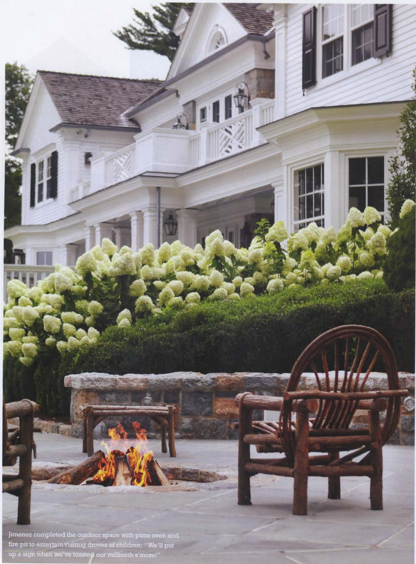
Jimenez completed the outdoor space with pizza oven and fire pit to entertain visiting droves of children: "We'll put up a sign when we've toasted our millionth s'more!"