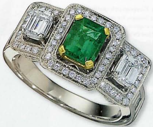
WELLINGTON & CO. FINE JEWELRY