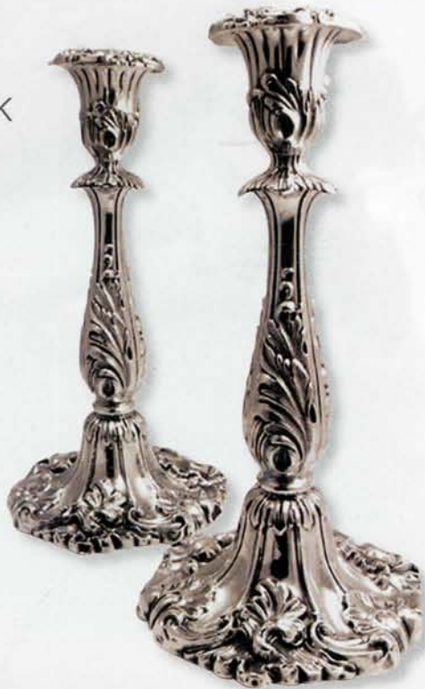
AS YOU LIKE IT