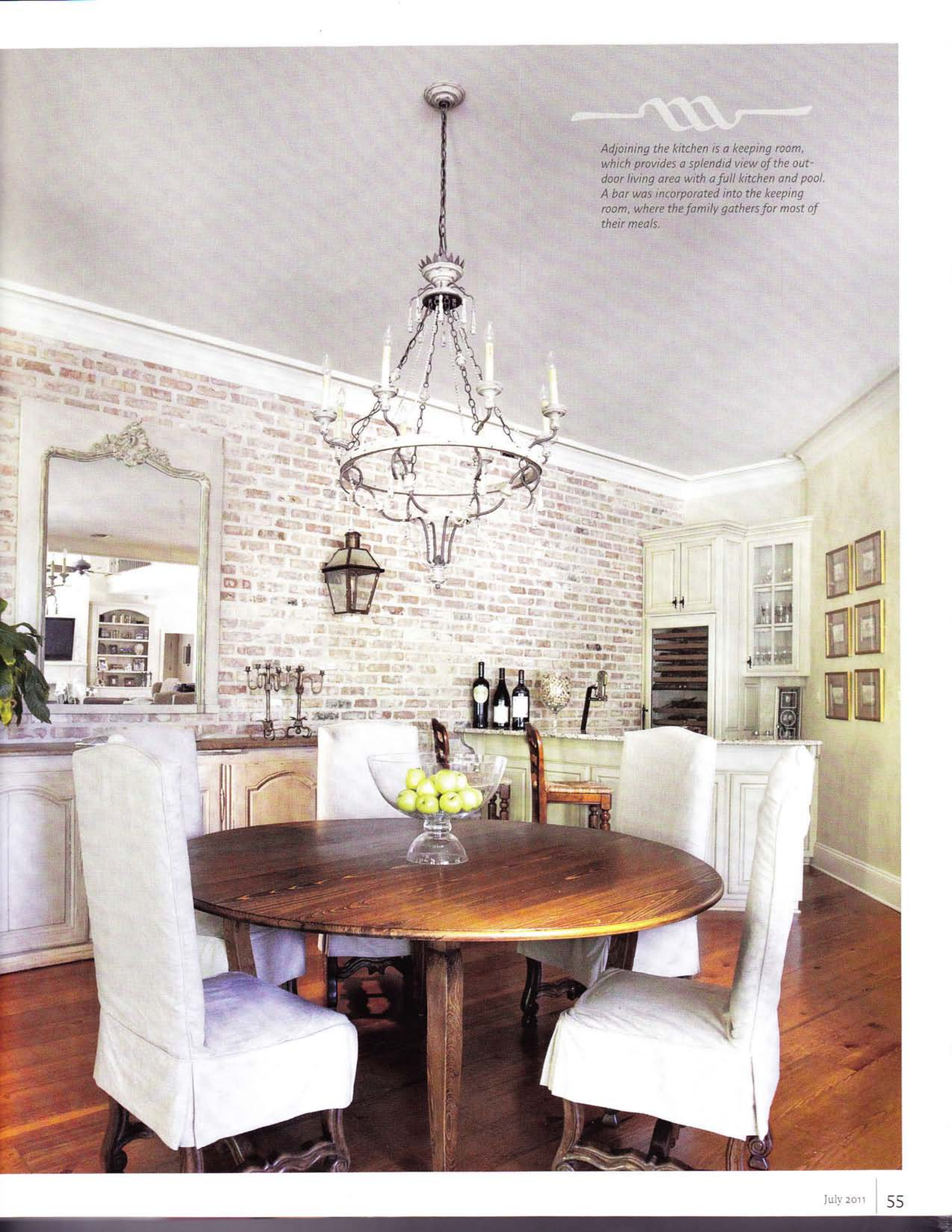
Adjoining the kitchen is a keeping room, which provides a splendid view of the outdoor living area with a full kitchen and pool. A bar was incorporated into the keeping room, where the family gathers for most of their meals.