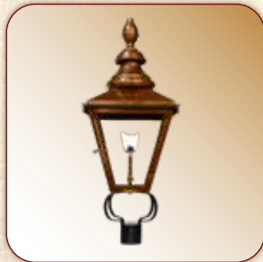
POST MOUNT LS-PM