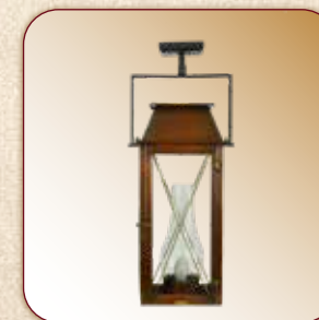
SQUARE YOKE CH-SY (14", 16", 22")

FOR MORE INFORMATION, VISIT WWW.BEVOLO.COM .