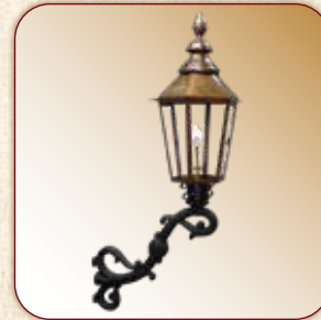
COMMANDER'S PALACE™ SSLS-CP