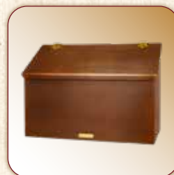
HORIZONTAL MB-H 10"H X 14"W X 6"D