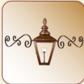
REVERSE SCROLL MUSTACHE LS-RSM