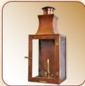
CARRIAGE - FLUSH MOUNT GOVCL-F (17", 24")