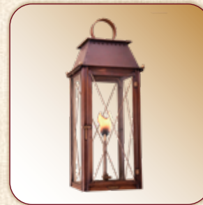
ORIGINAL BRACKET CH-OB