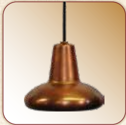
EAMES™ PND-EAM-PC 7.25"W