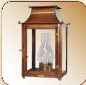
LOW PROFILE COLUMN MOUNT WM-LPCM (14", 16")