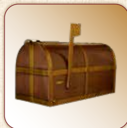
POST MOUNT MB-P 8"H X 7.25"W X 18.5"D

Charming and practical, our hand-crafted mailboxes are the perfect compliment to Bevolo® lanterns. Brass address numbers can be added.