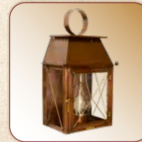
FLUSH MOUNT CH-FM