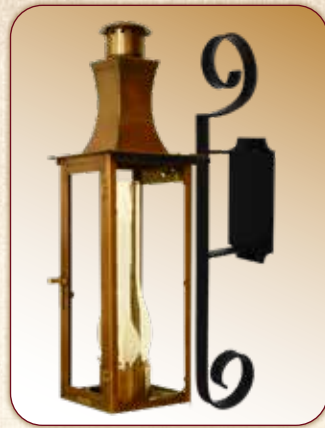
GOVERNOR® SCROLL GOV-GS