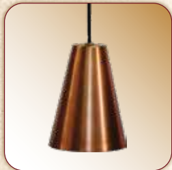
MID-CENTURY MODERN™ PND-MCM-PC 6.25"W