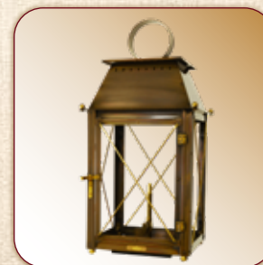
LOW PROFILE COLUMN MOUNT CH-LPCM (14", 16")