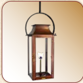
ROUND YOKE WM-RY (14", 16", 22")