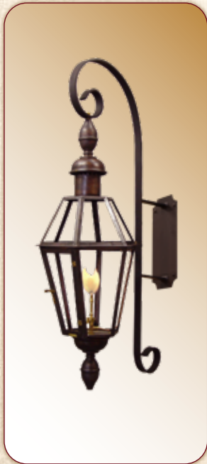
RODIN W/ TOP-BOTTOM FINIAL SS-R-LT-LB