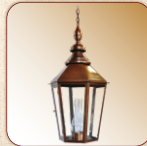
HANGING CHAIN SSLS-HC