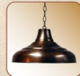
HANGING CHAIN WHD-HC