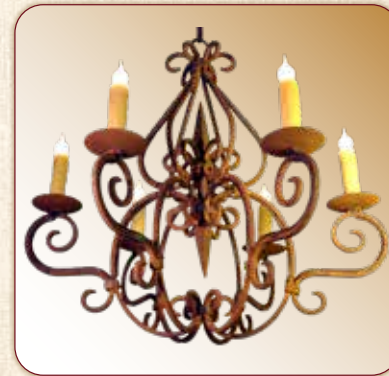
FLEUR DE LIS™