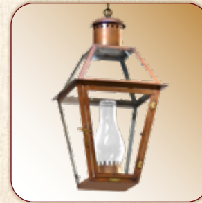
HANGING CHAIN FQ-HC