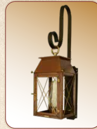
TUDOR SCROLL CH-TS