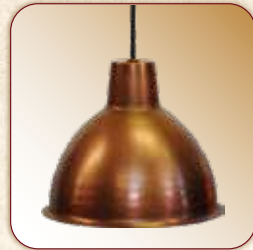
CUCINA™ PND-CUC-PC 10.5"W