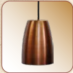
BULLET™ PND-BUL-PC 4", 6"W

Bevolo's® pendant collection was designed to be used in a number of applications including over an island, vanity or bar. All pendants are crafted using the same copper, care and precision as our lanterns. They can be hung using multiple mounting options. Available in electric only. Widths listed below.