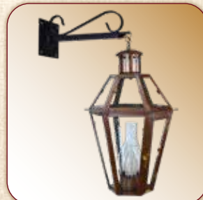
DROP BRACKET SS-DB