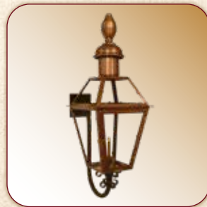
GOOSENECK W/ TOP FINIAL FQ-GN-LT