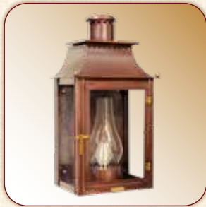
FLUSH MOUNT W/ STACK WM-F-WMS