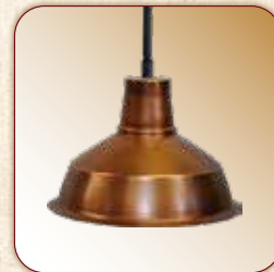
HANGING STEM FH-HS