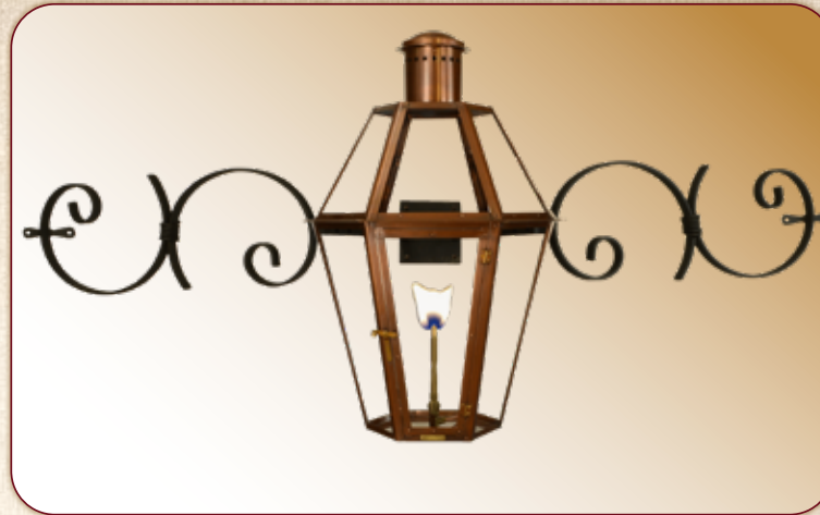
CIRCLE MUSTACHE SS-CMB