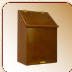
VERTICAL MB-V 14"H X 9"W X 5.5"D