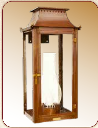
ORIGINAL BRACKET WM-OB