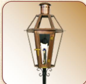
GOOSENECK W/ TOP FINIAL SS-GN-LT