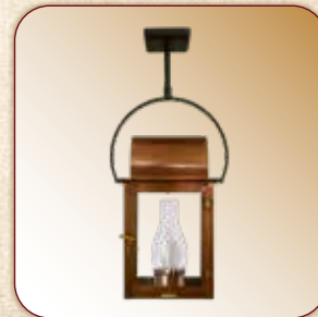
ROUND YOKE CX-RY (14", 16", 22")