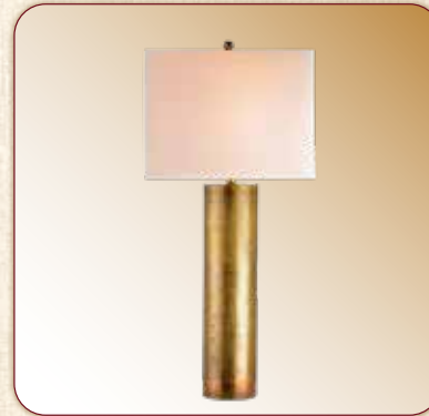
TABLE & FLOOR LAMPS