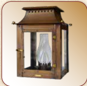
HEAVY WMH-B (16", 20")

FOR MORE INFORMATION, VISIT WWW.BEVOLO.COM .