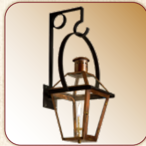
YOKE HANGER FQ-YH