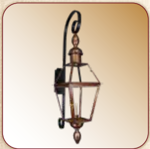
RODIN W/ TOP & BOTTOM FINIAL FQ-R-LT-LB