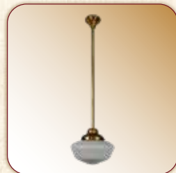
SCHOOL HOUSE™ SCH-HS 11.75"W