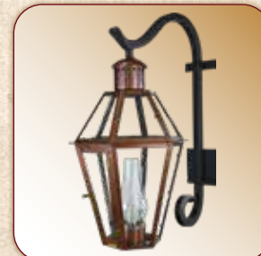
CAFÉ DU MONDE® SS-CF

FOR MORE INFORMATION, VISIT WWW.BEVOLO.COM .