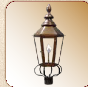
SPIDER POST MOUNT SSLS-SPM

FOR MORE INFORMATION, VISIT WWW.BEVOLO.COM .