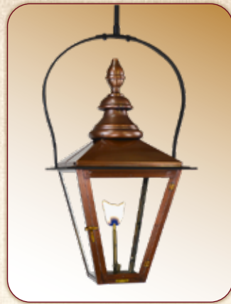
LONDON YOKE LS-LY