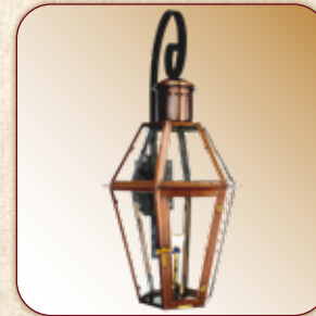
HALF RODIN SS-HR