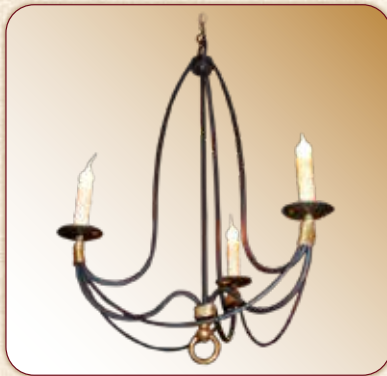
COUNTRY FRENCH™ THREE ARM