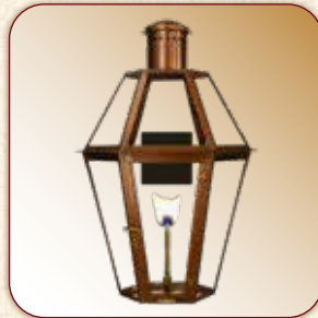
ORIGINAL BRACKET SS-OB