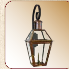
HALF RODIN FQ-HR