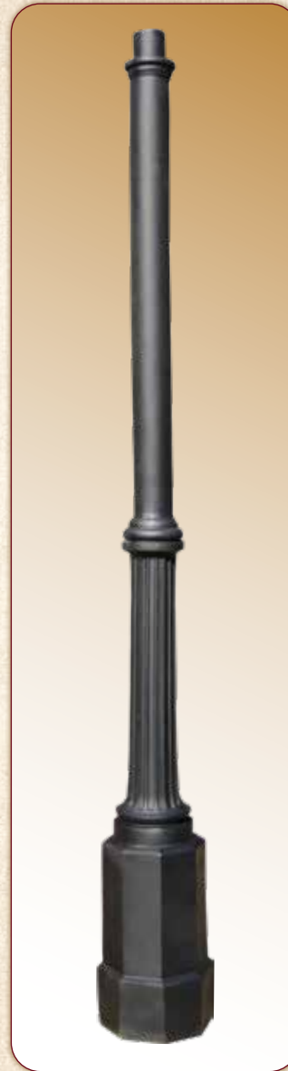
NEW ORLEANS™ E-P-NO