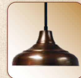
HANGING STEM WHD-HS