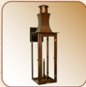
ORIGINAL BRACKET GOV-OB