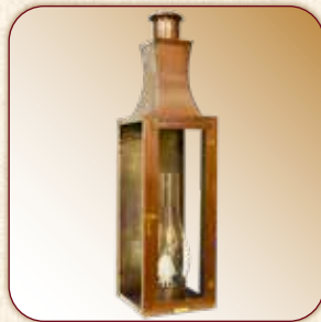
FLUSH MOUNT GOV-F