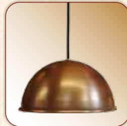
DOME™ PND-DOME-PC 12.25"W