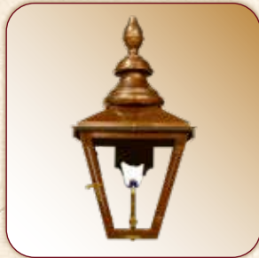
ORIGINAL BRACKET LS-OB-G