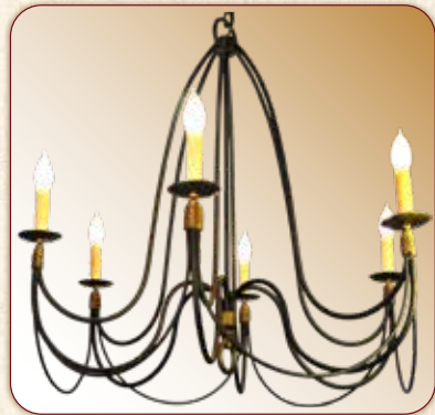
COUNTRY FRENCH™ SIX ARM