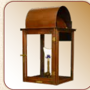
ORIGINAL BRACKET CX-OB