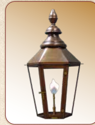
BRACKET MOUNT SSLS-OB-G