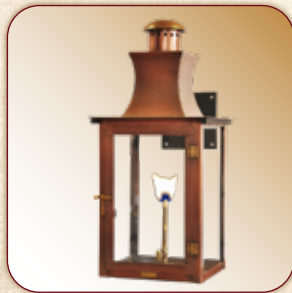
CARRIAGE - ORIGINAL BRACKET GOVCL-OB (17", 24")