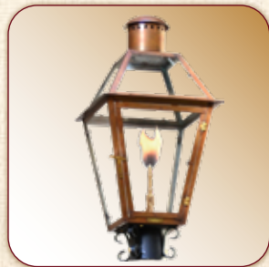
POST MOUNT FQ-PM