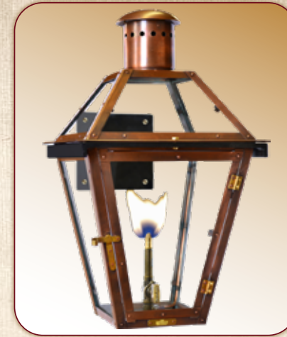
ORIGINAL BRACKET FQ-OB