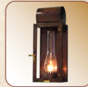
FLUSH MOUNT CX-F