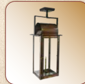
SQUARE YOKE CX-SY (14", 16", 22")