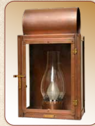
FLUSH MOUNT CX-F