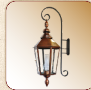
RODIN-LONDON BOTTOM SSLS-RB-LB