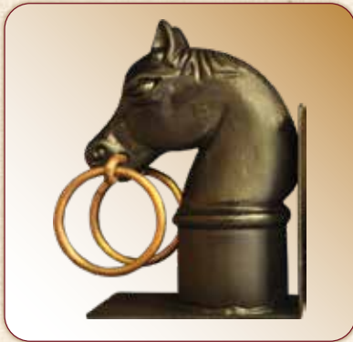
HORSE HEAD ACCESSORIES