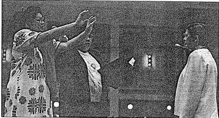
A speaker receives a blessing from the goddess Sophia at "Re-Imagining 1993," a pseudo-Christian conference promoting goddess worship and lesbianism, funded by the PC(USA).