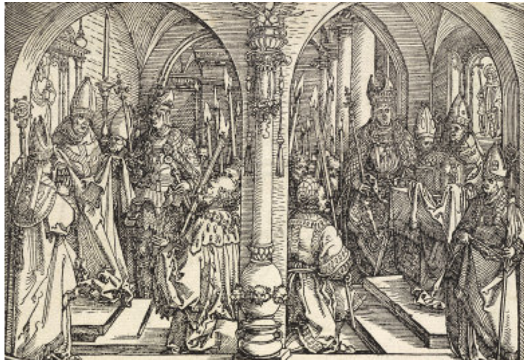
3 ALBRECHT ALTDORFER The Exposition of the Trier Tunic and the Canonization of Saint Leopold Arch of Honor (detail), 1517 Woodcut Albertina, Inv. DG1935/973

The background to this story begins with the fact that, according to the 1493 Nuremberg Chronicle of Harmann Schedel, Trier was considered the fifth city founded in world history after Jerusalem, Nineveh, Sodom and Gomorrah, and Memphis—i.e., centuries before Rome. And in this ancient, imperial, even electoral residence, young Maximilian had an absolutely fateful encounter in the autumn of 1473. This took place within the framework of a political summit between his father Frederick III and one of the then most powerful regents in Europe, Charles the Bold (cat. 1), who was duke of Burgundy and father of Maximilian's future spouse Mary. Beside the successful marriage contract and the mutual problems with France's politics, there was also the question of a European stand against the Turks. The electors resided in Trier's Bischofsburg for two months. And since most of the negotiations took place only in the smallest circle, it seems clear that young Archduke Maximilian had the leisure to learn something about the mythical age of the city and its ancient buildings. For, after all, the Palastaula—or Emperor Constantine's