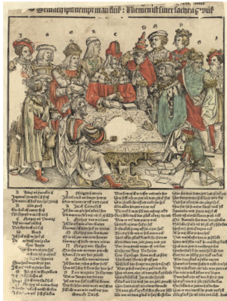
1 ANONYMOUS In High Society (group portrait of fifteen European rulers playing the card game "Flüßliß") Woodcut, colored with the aid of a stencil, 38.5 × 29.4 cm Zurich, Zentralbibliothek, Kantons-, Stadt- und Universitätsbibliothek, Inv. PAS II 24/14

final bell tolled. He wanted to be remembered as the greatest emperor since Charlemagne, as the “great huntsman” (groß waidmann), as Maximilian calls himself in his book of hunting; as the brilliant and wise king, or “Weisskuning”; as the lofty-minded one, the “Theuerdank”; and as the youthful and joyful white knight, the “Freydal” (see cat. nos. 74, 73, 72). At the same time he was able to ask himself, half-jokingly and half-seriously, what God could have been thinking when he made a chamois hunter like him emperor. Especially in the last decade of his reign, when he enlisted the help of his literary and artistic editors and intensified the work on his image-cultivation projects, the tone of resignation became louder. One idea he considered in view of his increasing age and rapidly deteriorating health was to resign from the affairs of government and to retire to a monastery; the alternative was to idealize his person and his reign in literature and art.