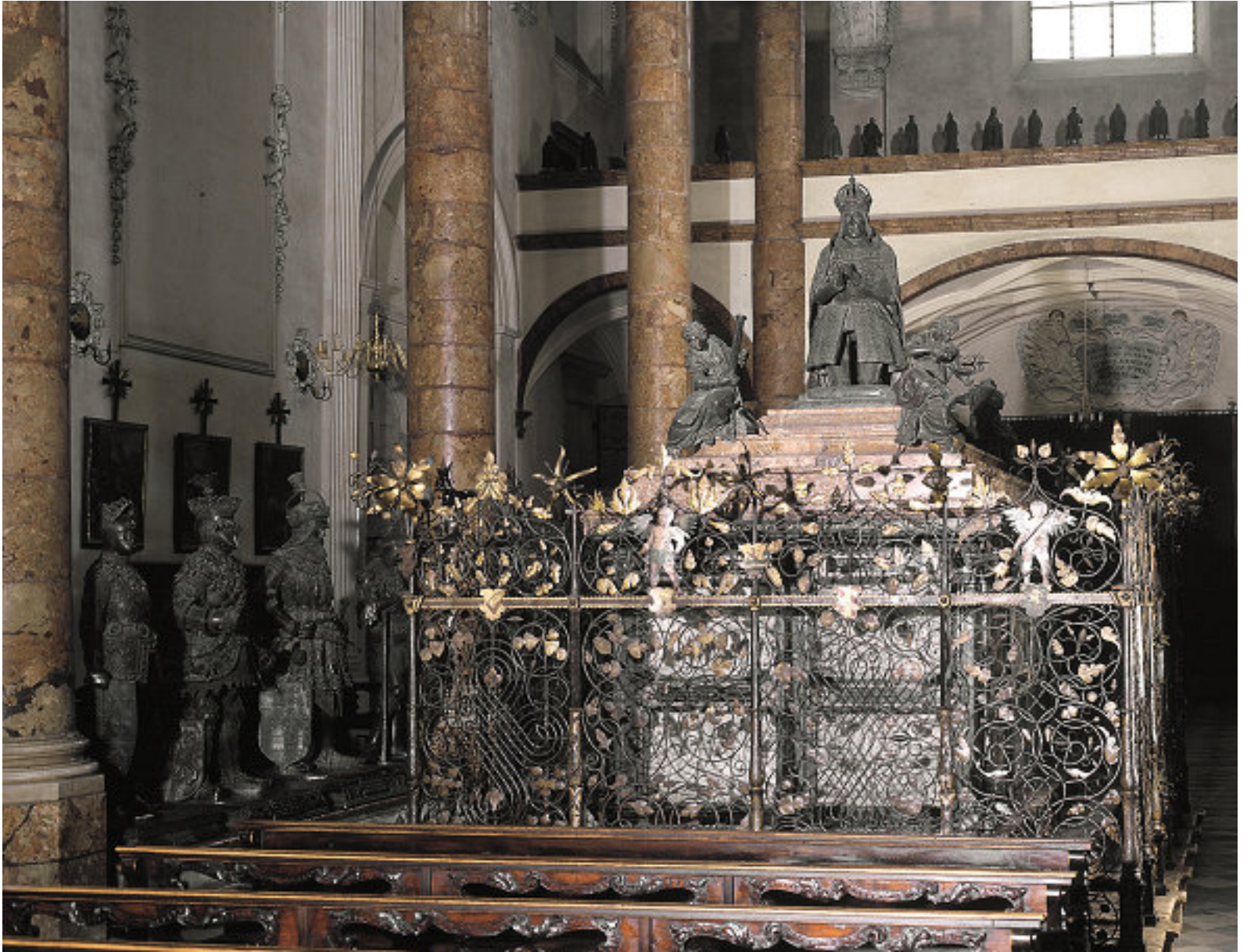
2 Cenotaph of Maximilian I Innsbruck, Hofkirche