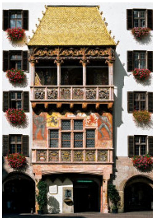
9 Goldenes Dachl (Golden Roof), Innsbruck