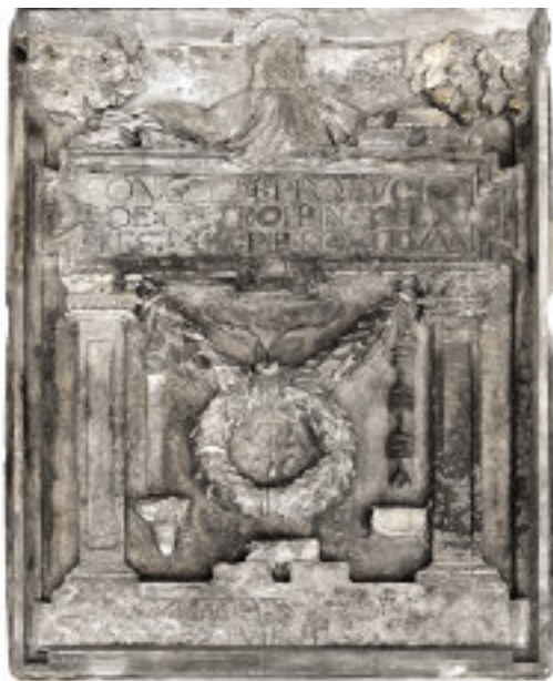
1 Tomb of Conrad Celtis, ca. 1515 Vienna, St. Stephan's Cathedral

As shown above, the Christian aspects of fame, death, and posthumous renown are literally pushed to the sidelines in the Celtis woodcut, the Triumphal Procession , and the Arch of Honor . In the latter (aside from the statues of Saints Arnulf and Leopold), Christian themes are touched upon solely in a few scenes in the towers. One of these shall now be the subject of closer scrutiny