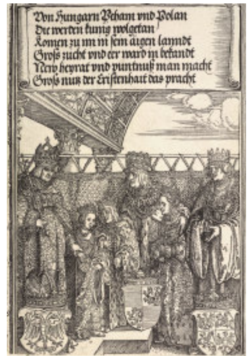
7 ALBRECHT DÜRER The Viennese Double Wedding Arch of Honor (detail), ca. 1515 Woodcut Albertina, Inv. DG1935/975/12