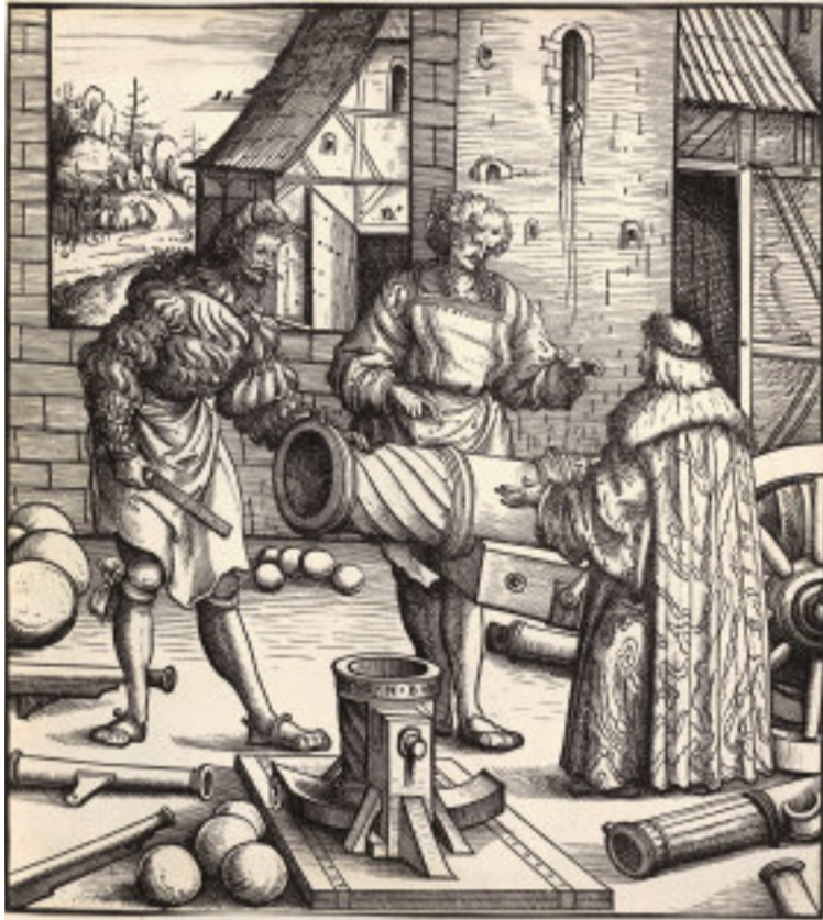
3 HANS BURGKMAIR THE ELDER Maximilian I and the Artillery Weisskunig , ca. 1515 Woodcut (1775 edition) Albertina, Inv. Cim II/6, fol. 34

he valued greatly. 25 Only in the face of death did he finally gain the insight that his twenty-seven wars had served only the devil.