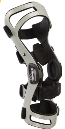
*Silver Metallic shown