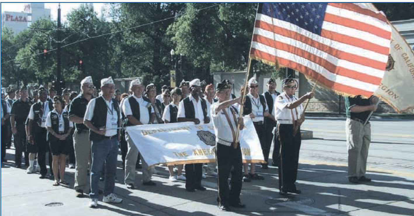
The Department of California at the beginning of the National Parade in Salt Lake City.