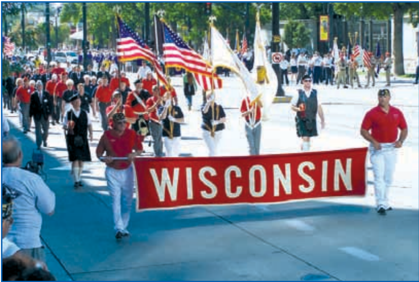
The Department of Wisconsin.