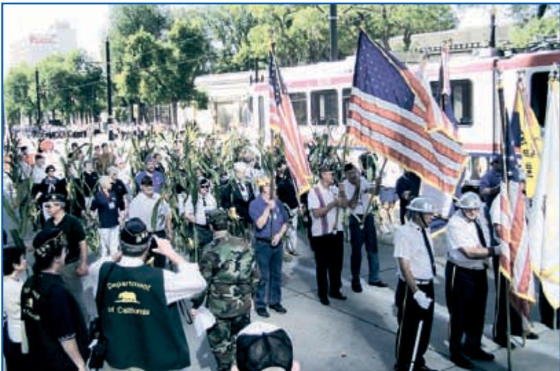
The Department of Iowa.