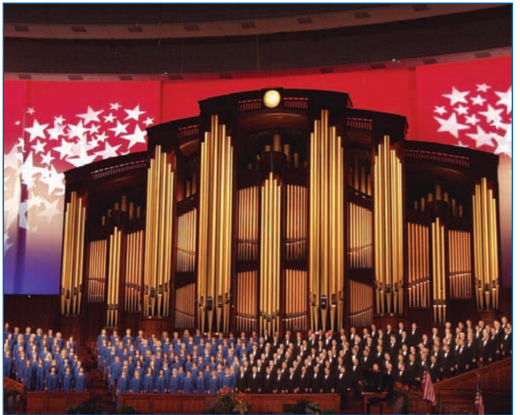
Mormon Tabernacle Choir during the Memorial Service for National Convention Delegates in the new LDS Conference Center in Salt Lake City, Utah.