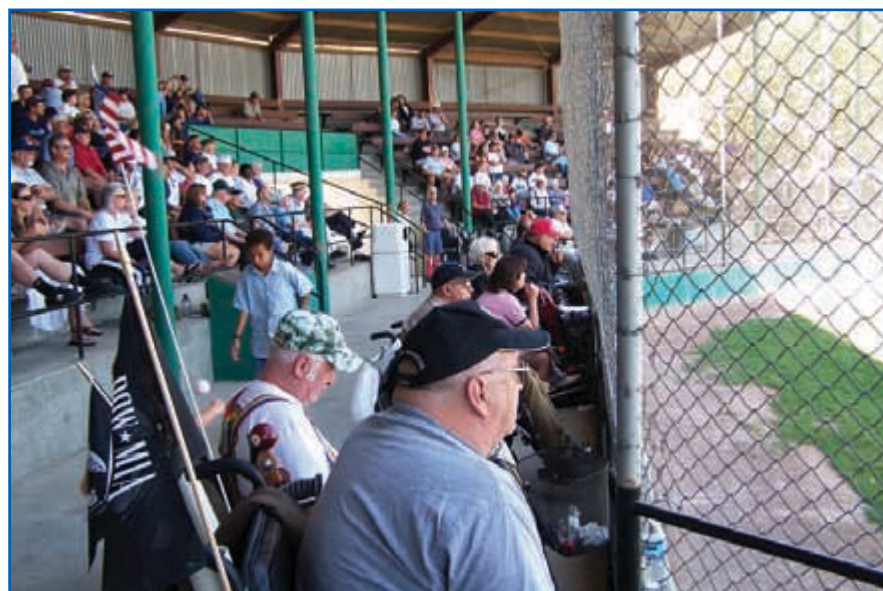
Legion Days at Yountville Veterans Home, Yountville, CA.