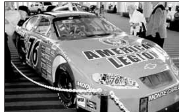
The American Legion NASCAR.