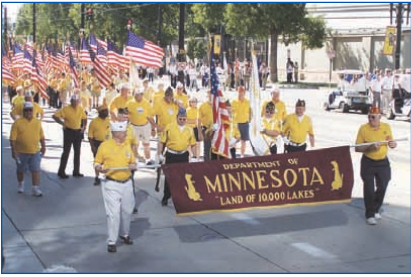
The Department of Minnesota.