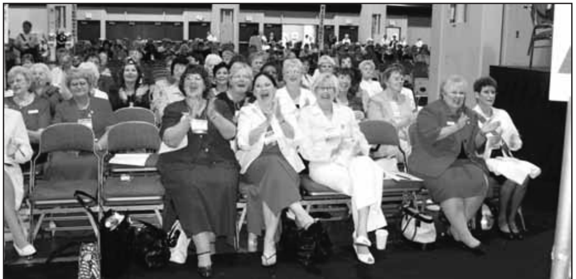
Department Leadership enjoy 88th National Convention in Salt Lake City.