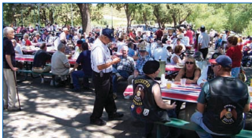
Legion Days at Yountville Veterans Home, Yountville, CA.