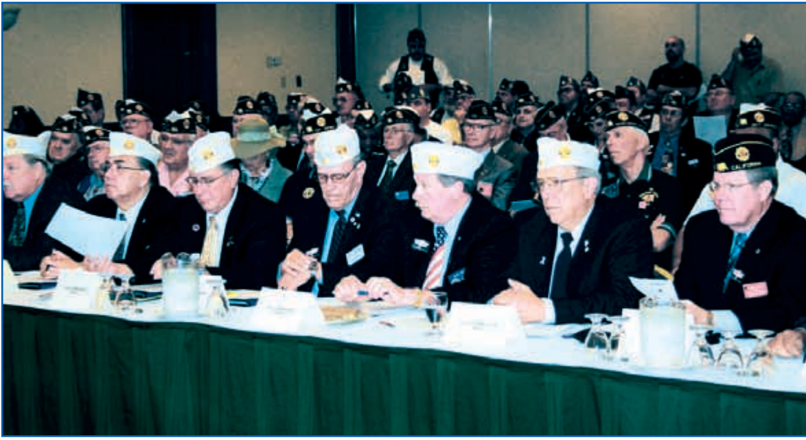
Newly elected Vice Commanders attend their first DEC in Visalia, CA.