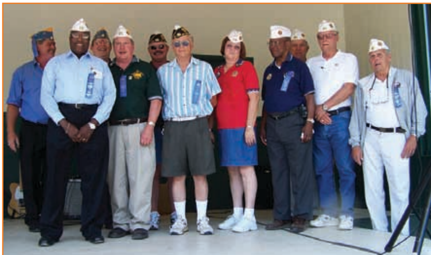
California Leadership at Yountville.