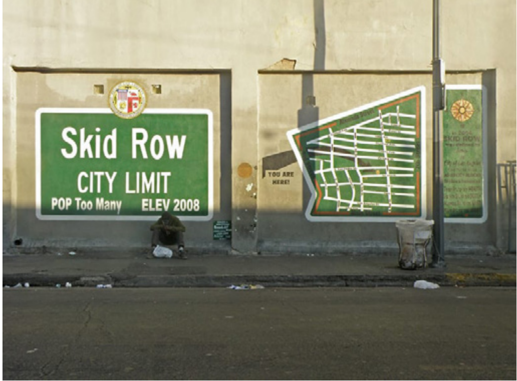
In 2015, the VA estimated that as many as 6,000 homeless veterans live in Los Angeles in areas like Skid Row, pictured here.