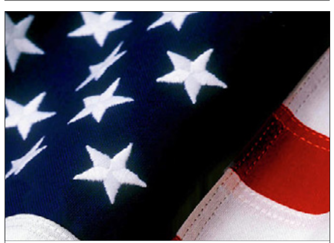
Your post can receive a credit for each dollar spent on the purchase of American Flags from Emblem Sales.