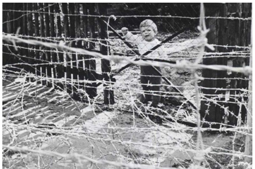
A young girl in the Eastern Sector looks through barbed wire into Steinstucken.