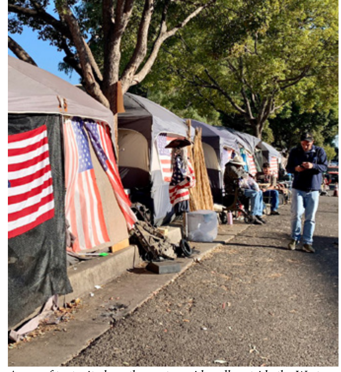
A row of tents sit along the western sidewalk outside the West Los Angeles Veterans Affairs campus.