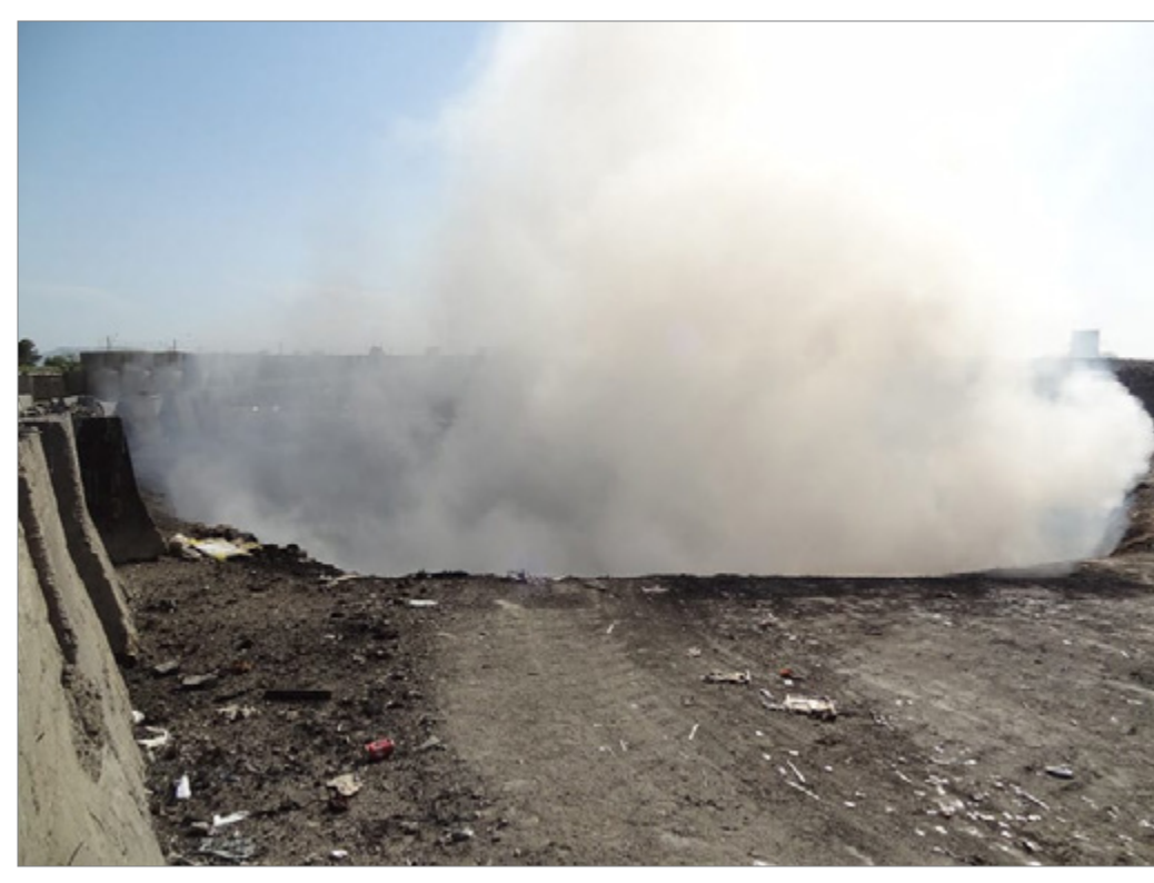
Toxic sites like the Open-Air Burn Pit at FOB Salerno in Afghanistan (pictured here, 2012) have been linked to respiratory illnesses suffered by veterans of wars in Iraq and Afghanistan.