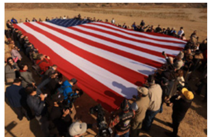
Orange County’s veterans cemetery may now have a new home after a groundbreaking ceremony in Anaheim Hills and proposed legislation from a state senator.

Great Park was one of the three sites originally debated for the veterans cemetery.