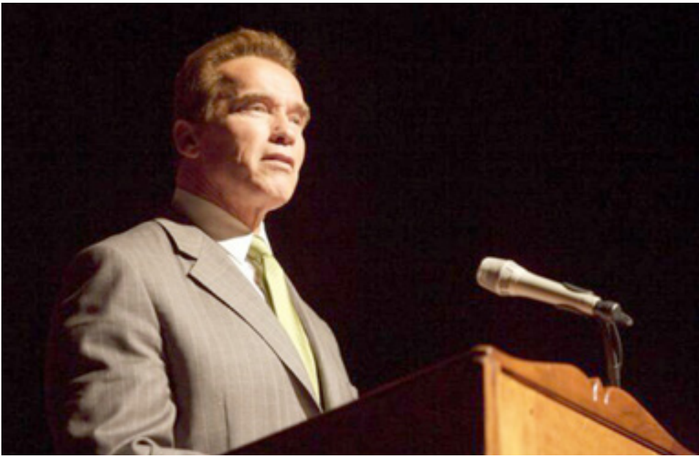
Former California Gov. Arnold Schwarzenegger