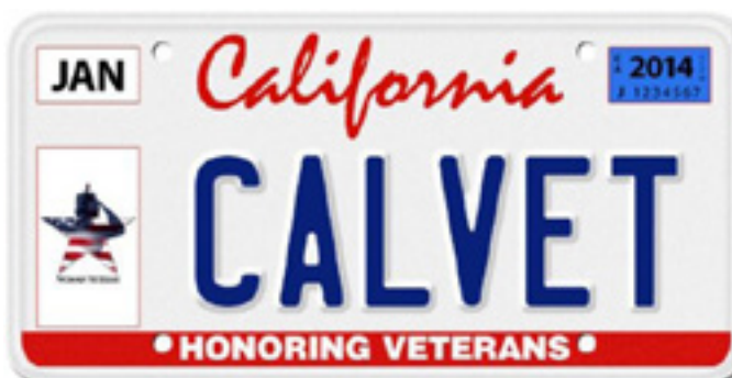
A rendering of the first California license plate honoring women veterans created by U.S. Air Force veteran Jan Kays.

But until we get there until society realizes that women are veterans as well, this is just another way that we can honor the service of these women.”