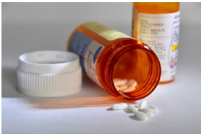
The VA is considering a new policy that would reduce copayment for certain medications for veterans deemed to be at high risk for suicide by a VA clinician.

Readers can reach out to California American Legion for free help with VA services and benefits.