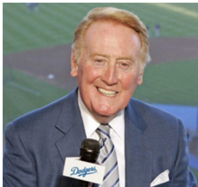
Vin Scully

The Department of Veterans Affairs lists veterans homelessness as a priority and has recently improved its efforts to mitigate the crisis, including raising rent grants for veterans living in high-cost rental markets as well as announcing that it plans to house over 500 veterans living in Los Angeles by Dec. 31, 2021.