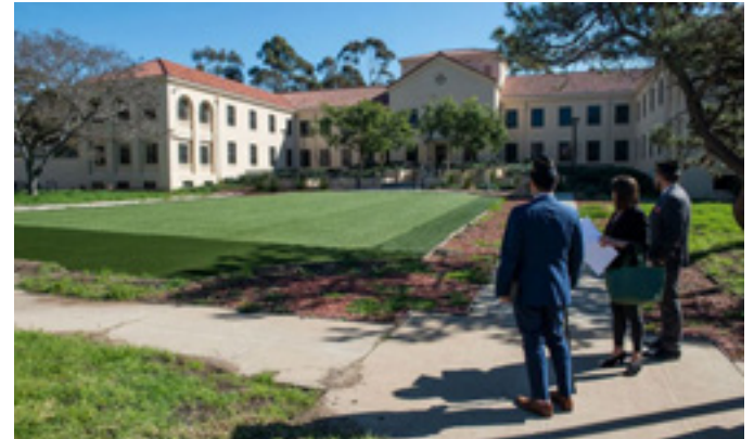
American Legion national staff tour the West Los Angeles VA during a “System Worth Saving” site visit on Thursday, Feb. 7, 2019.