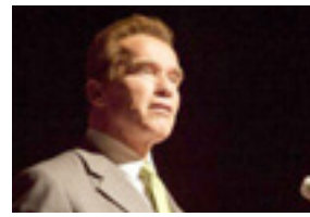
Governor donates $250k