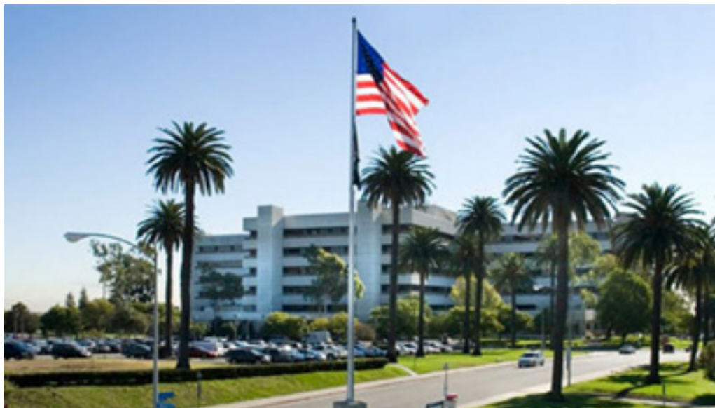
West Los Angeles Veterans Affairs campus