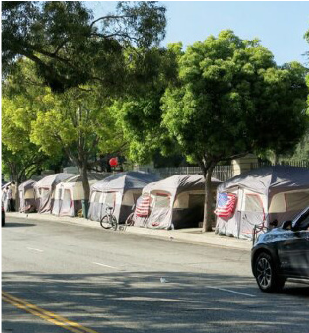
“Veterans Row,” pictured here in May 2020, was cleared in early November by the city of Los Angeles and volunteers, but nearly 4,000 homeless veterans are still living in the city.