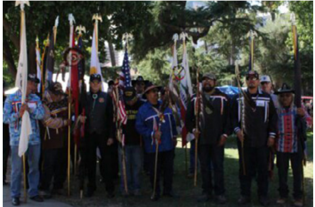
According to CalVet, Native Americans serve in the U.S. Armed Forces at a higher rate than any other demographic.

Additionally, free resources on veteran suicide prevention can be found here: www.va.gov/health-care/health-needs-conditions/mental-health/suicide-prevention