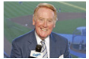
Skully the voice of homeless vets