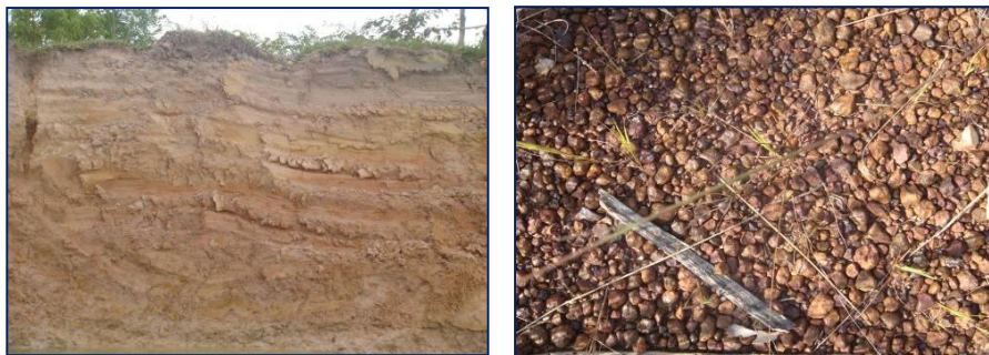
Type of soil

Furthermore, the land plot must be close enough to a source of water in order to facilitate irrigation.