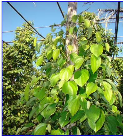
Big leaf variety