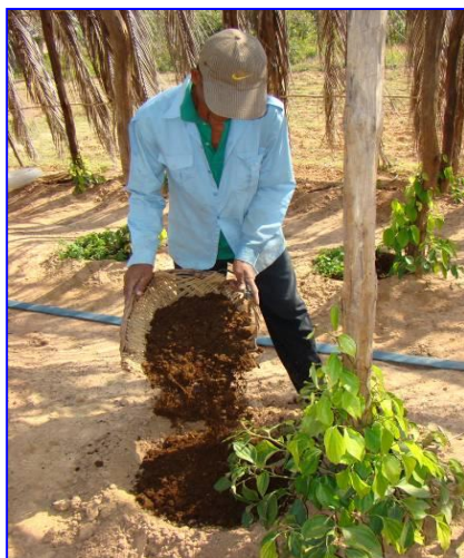
Putting green manure