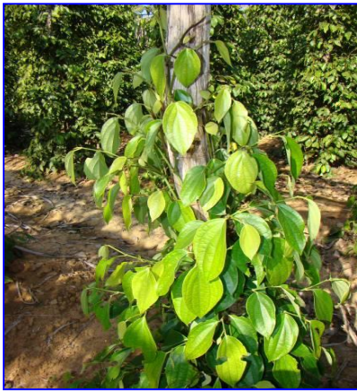
Small leaf variety

These two varieties must come from the defined geographical area.