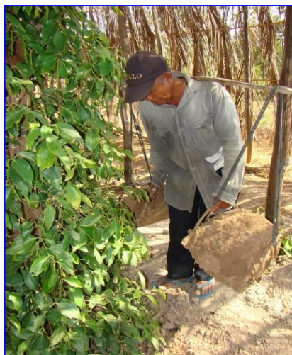
Putting exogenous soil