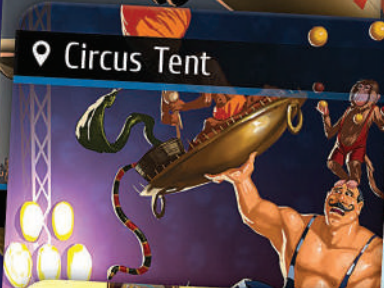
📍 Circus Tent