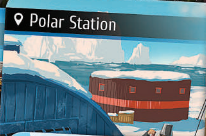
📍 Polar Station