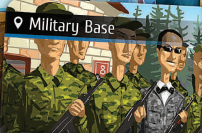
📍 Military Base