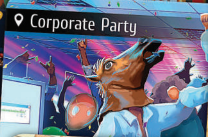
📍 Corporate Party