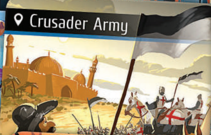
📍 Crusader Army