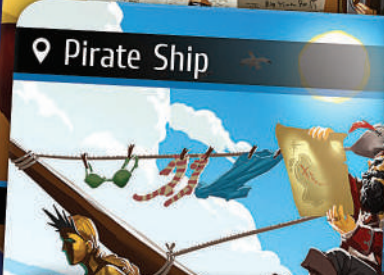
📍 Pirate Ship