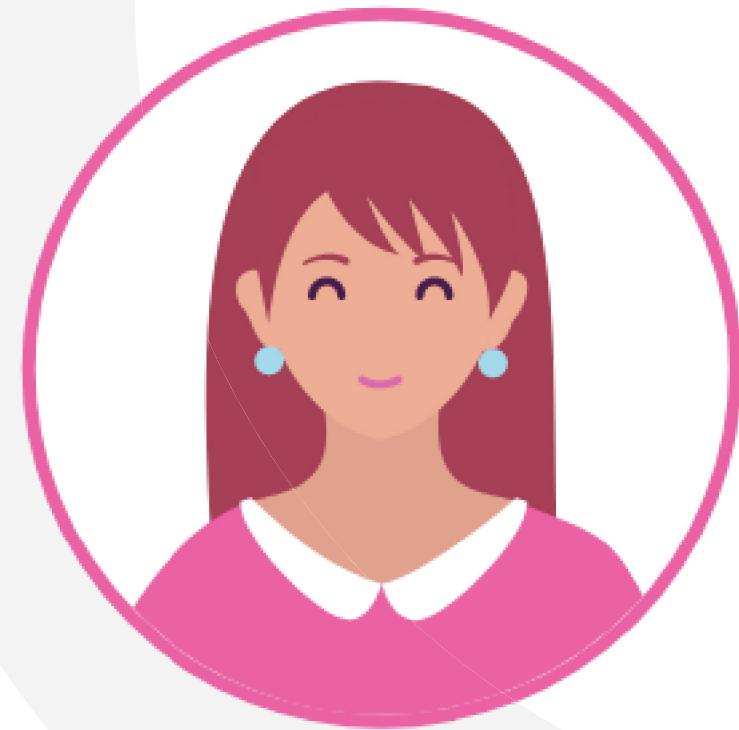
Admin staff journey