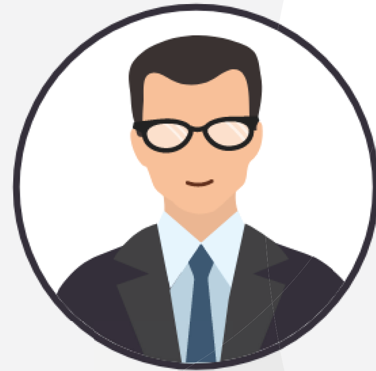
Course manager journey