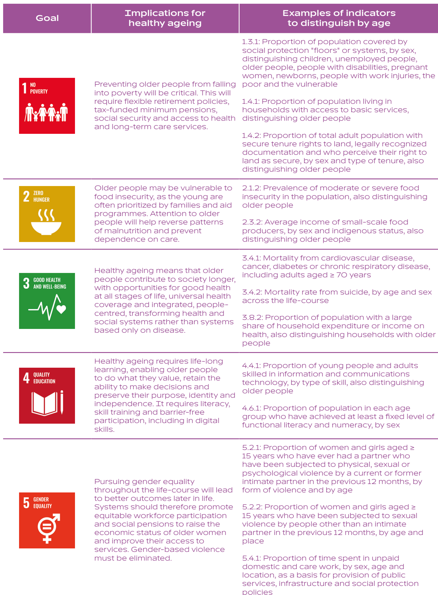
Table 2. Relevant Sustainable Development Goals, indicators and data disaggregation required for healthy ageing