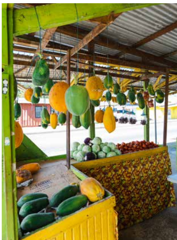
A fresh fruit and vegetable stall in Bon Accord, Tobago.