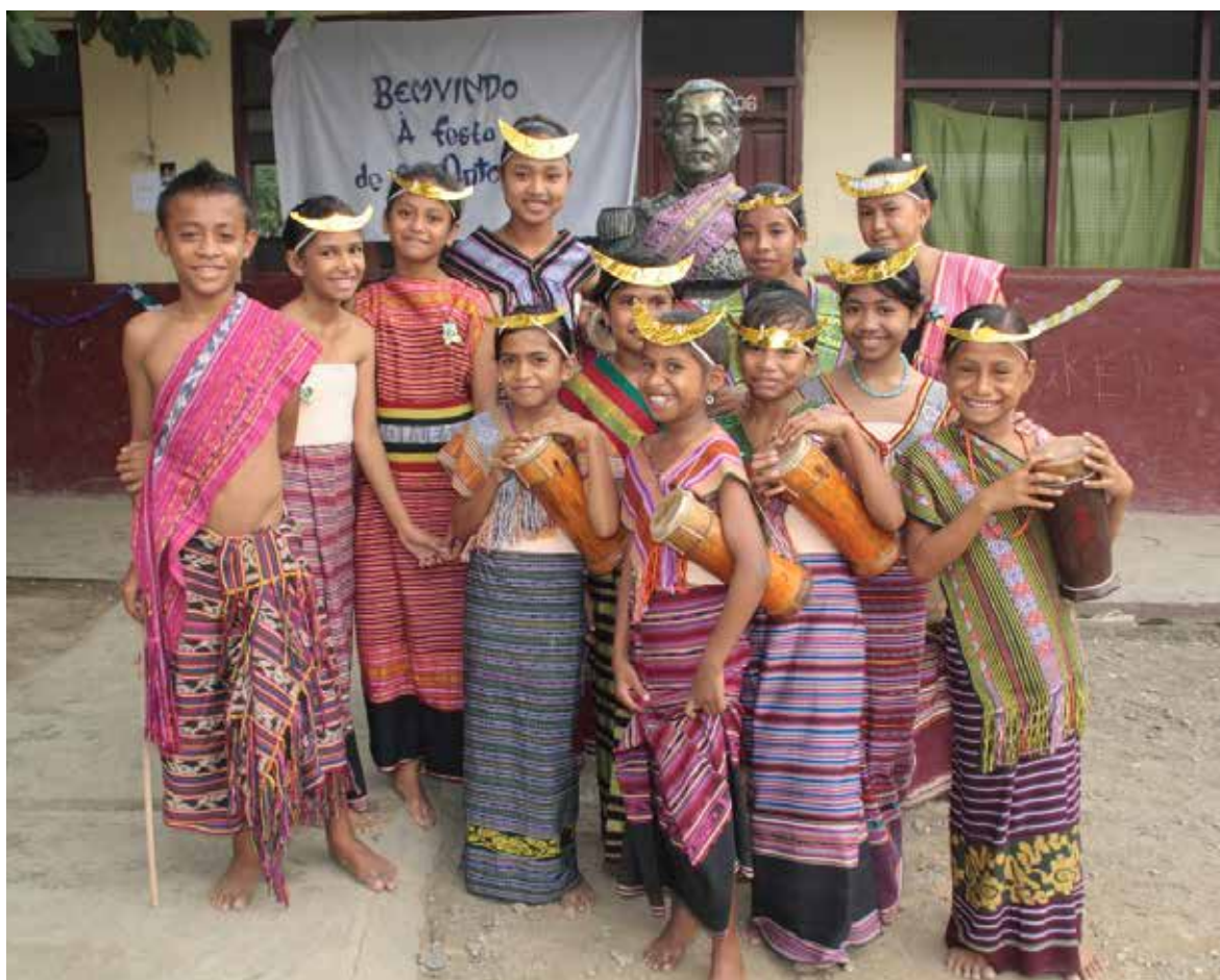
Primary school students in Timor-Leste dressed in traditional attire for a special event at their school (Children dressed in traditional clothes in Timor-Leste)