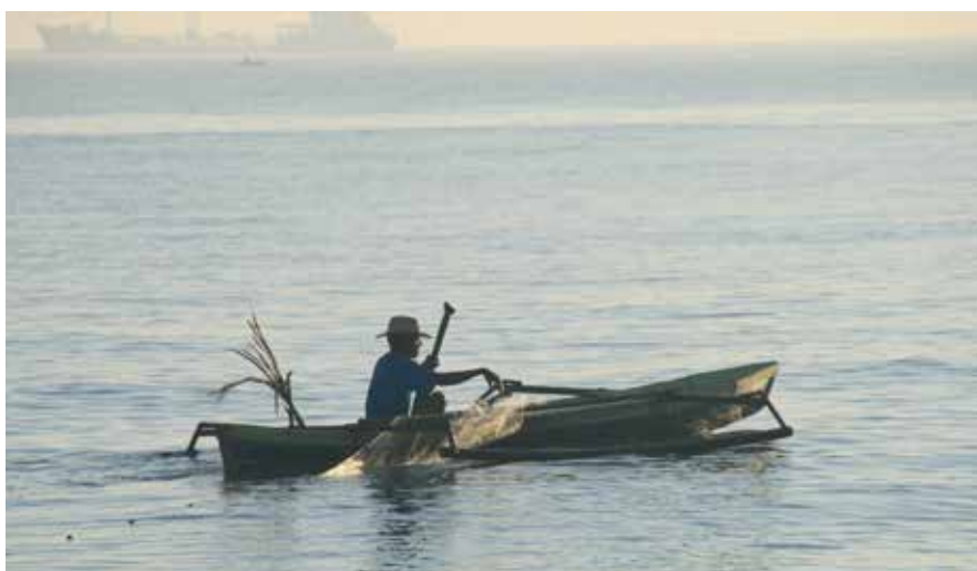
A fisherman releasing fishing net into the sea, Pante Kelapa, Dili, Timor-Leste