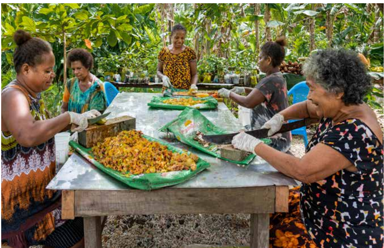
Women working on nutritional projects with fruits and vegetables as part of an education programme to prevent NCDs by promoting healthy diets in Tulagi, Solomon Islands