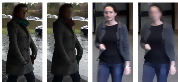
(a) Original. (b) Modified. (c) Original. (d) Modified.

Figure 2 presents two pairs of frames (original and modified) which show the results of the applied cartooning effect. The re-colouring of personal items is nicely visible at the scarf and the bag in Figure 2b.