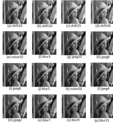
Fig. 2. Images for testing image fidelity metrics

more n – the more noise); 3) jpeg( n ) – image after compression by JPEG for different sizes of block (the less n – the more defects); 4) blur( n ) – Gaussian blur (the more n , the more blur).