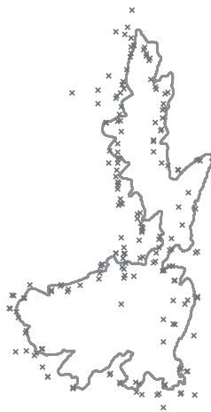
Fig. 2. Inference of hubs

The cartographic line that we try to infer consists of 6595 links (edges) and 6607 hubs (vertices). The edges have a length of 4041 pixels, as the reference system is in pixels. Sampling of eye tracking data is at 60 Hz (0.017 sec). Data comes from 3 different users with a total length of 89880 pixels ( Fig. 1 ). Following the various stages of the polylines inference algorithm, the following output is produced. During the first phase, i.e., hubs extraction and connection, 109 hubs and 300 link samples are generated. The second polylines inference phase, i.e. compacting links, produces 119 hubs, 79 links and a length of 2990 pixels. This result shows that during the second phase of the algorithm, the number of hubs remains largely constant but only the length of the links connecting them is significantly reduced since we radically merge links during this phase. Fig. 3 visualizes the inferred polylines in blue and the actual cartographic data in grey color.