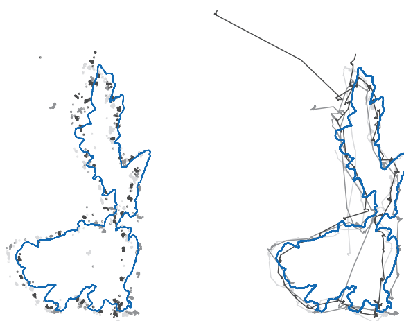
Fig. 1. Eye tracking data from 3 subjects

The aim of this work is to derive a single polyline geometry from sampled eye tracking data from multiple users. Fig. 1 plots data used in our experiment as samples (left) and tracks (right) at varying shades of gray for each subject, along with the actual cartographic line that the subjects have been asked to follow, which is shown in blue.