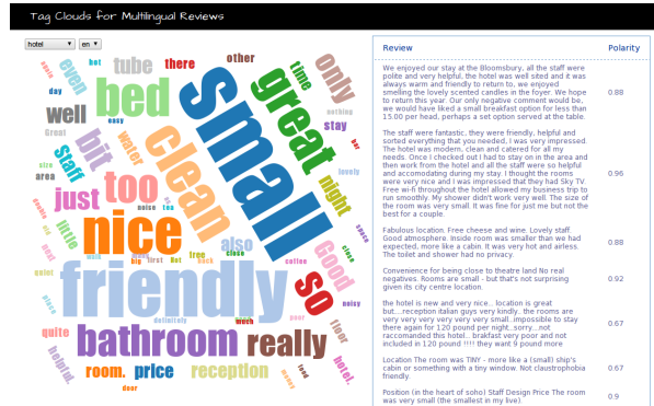
Fig. 2. Simple service that uses the resources in EUROSENTIMENT to analyse opinions in different languages and domains