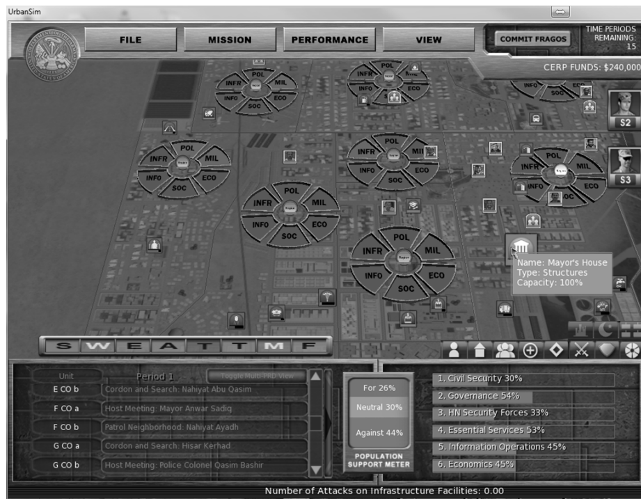
Fig. 1. UrbanSim

where the available information is often overwhelming, but at the same time may be incomplete. In other words, students should realize that their decisions produce intelligence that may be critical for decision making and planning during the next set of turns. Students can learn about the effects of their actions by viewing causal graphs provided by their security officer (S2). Users who adopt strategies to better understand the area of operation and its culture by viewing and interpreting the effects of their actions using these causal graphs should progressively make better decisions in the simulation environment as the COIN scenario evolves.