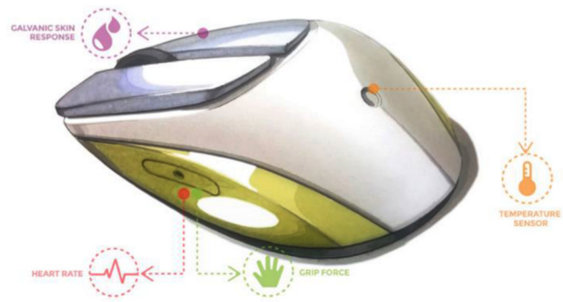
Fig. 1. Mockup Design of CogniMouse.