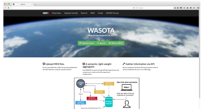
Figure 2: Home page of the WASOTA web interface, available at the URL http://wasota.aksw.org/ .