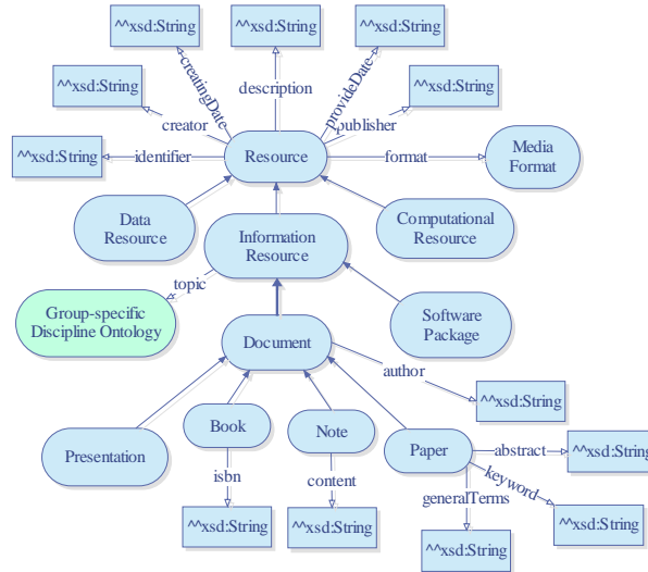
Fig. 2. Resource Model

resources with WonderDesk at present, this kind of hierarchy concerning more general resources provides scalability for potential extension by any third-party.