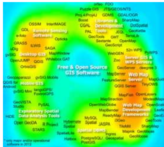
Fig. 2. Free and open source GIS Software

On the other hand authors [27] do not include popular web mapping Application Programming Interfaces (API's), such as Google Maps, Yahoo! Maps or BingMaps, Google Earth application on the list of free and open sources (fig. 2).