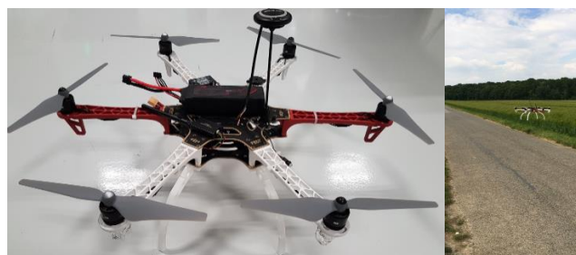
Fig. 2. The autonomous drone assembled at ESTACA. The drone in the landing process.

The drone has been tested using a pilot mission programmed using QGroundControl [13]. QGroundControl provides flight control and vehicle setup for PX4 powered vehicles. QGroundControl enables mission planning for autonomous flight. QGroundControl will be used to define the mission profiles in step 2 of our methodology.