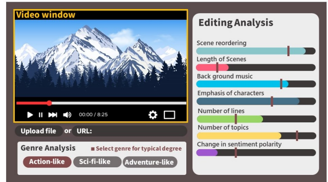
Figure 3: User Interface

4.2.4 Change in Sentiment Polarity . In addition to the background music, the emphasis of the characters, topics in the lines, and script also change the sentiment polarity of the trailer (see Figure 2(d)). In