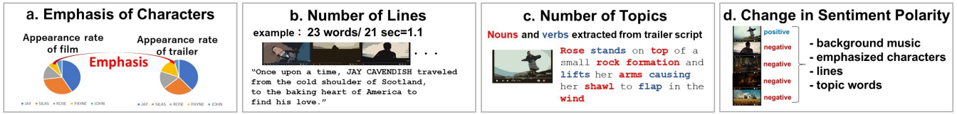
Figure 2: Content Biases

4.1.3 Background Music . Tomino [13] noted that sound elements such as background music and sound effects can give movies continuity. Vineyard [14] noted that the sound design of a movie is not a visible feature of editing. He defined a sound design as a factor that can determine the atmosphere of the movie. Because a movie trailer is a mixture of audio and visual content, background music has a strong influence on a viewer’s impression regarding sentiment. Furthermore, it is evident that background music is an effective way to emphasize the mood of a certain situation in a trailer. Some editors use music that does not exist in the movie to emphasize a particular mood. In this paper, the background music is defined as one element of the sentiment polarity of a movie trailer.