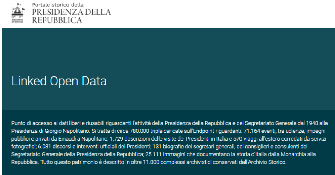
Fig. 5 – The access page to ASPR LOD.

The Portal Archivio storico della Presidenza della Repubblica [41] has been published on 2 June 2018 with the aim of preserving, enhancing and sharing the memory of the Archives of the Presidency of the Italian Republic (ASPR), as part of a broad process of innovation of communication strategies and enhancement of the archival heritage. Thousands of resources in Linked Data format as well as the ontologies used to describe the domain can be accessed from the Portal ASPR LOD (fig. 5) [42].