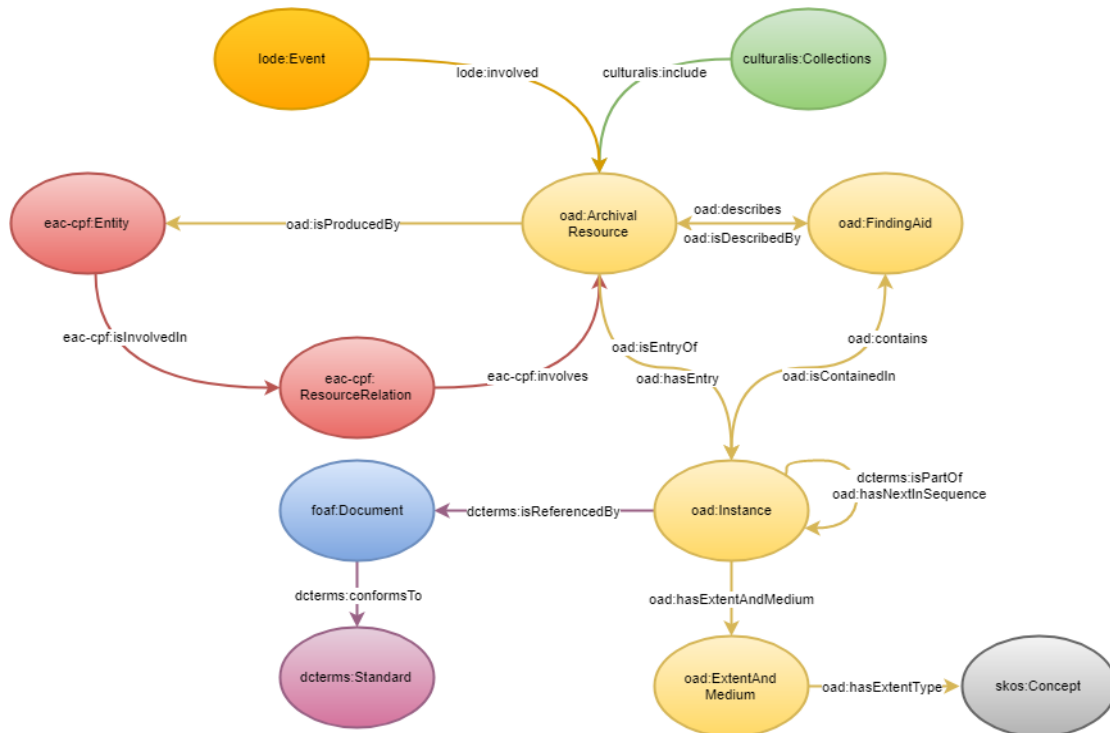
Fig. 2 – The graphical representation of the OAD ontology.

The classes oad:custody , oad:production and oad:uod have been deprecated: the first two have been deprecated because their description had been integrated in the new EAC-CPF Ontology release [35], while oad:uod has been replaced by oad:ArchivalResource . On the basis of the same pattern of reasoning, the object property oad:has_relatedUnitOfDescription has been translated in oad:hasRelatedInstance .