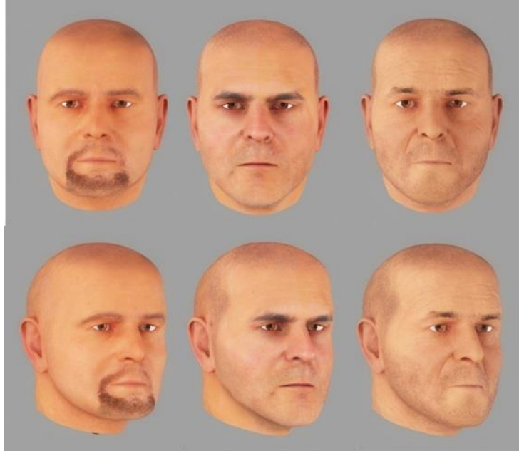
Fig. 2. Three versions of the character's head. Two angles.

To run the experiment, we created the one 3D character model head. Texturing was made in the common way [3], and we spent the 6 working days for that. We used fragments of the textures that have created for this head to replenish the library of our complex. There the 3D geometry has exploited as the basis for creating the following faces.