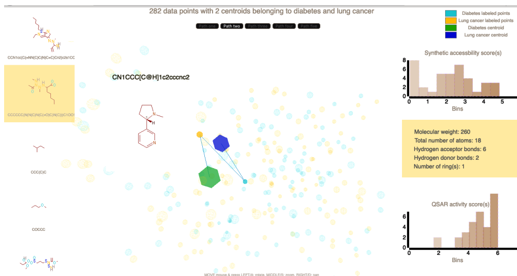
Figure 2: Visualization of the path in the latent space along which our algorithm is interpolating. On the left are generated compounds not present in the training data. On the right are histograms of different molecular properties, including synthetic accessibility, activity scores.