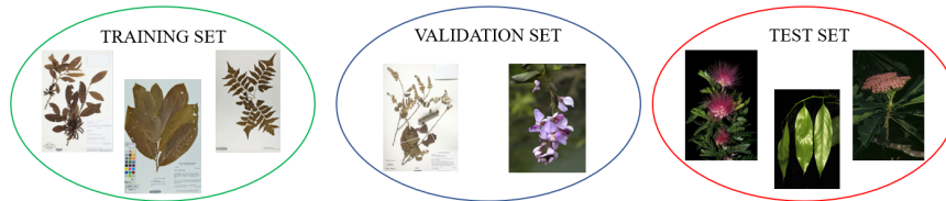
Fig. 1: Examples images of the PlantCLEF 2020 dataset. The large discrepancy between training and test data cause the difficulty in the PDA.

Experimental results show that ACL achieves higher classification accuracy than several baseline methods and yields promising results on the PlantCLEF 2020 Challenge.