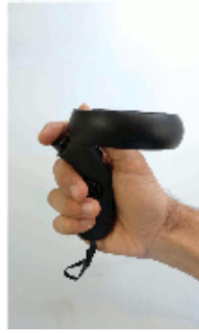
Figure 2: The VR controller

by different HMDs producers (HTC, Oculus, Samsung etc.), the interaction possibilities offered are more or less the same: pushbuttons and analog input peripherals (sticks, pads etc.).