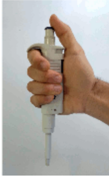
Figure 1: The pipette used for the DNA extraction task