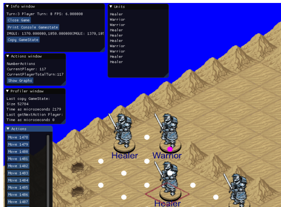
Figure 2: Exemplary game state of STRATEGA and its GUI.

files. The excerpt of the Action YAML-file shown in Figure 3 shows the definition of an Attack action. Several properties can be configured and even new properties can be added to the framework. In the example, the attack action has a range of 6 tiles, damage of 10 (that can affect friendly units) and establishes if and how much score the attacker and attacked players receive when the action is executed.