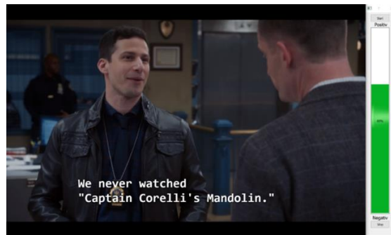
Fig. 1. Example scene from a TV show (left). Python script displaying the currently chosen value on the Arduino slider. The GUI also depicts a rudimentary scale (right).

The annotation system consists of an Arduino microcontroller connected to a linear potentiometer, which is paired with a slider. The Arduino itself is connected to a computer running a Python script. The script represents the core of the system, it is responsible for reading the current value of the slider, logging it and presenting it to the user in a small GUI while watching the movie on a TV. The slider depicts continuously changing resistance levels between 0 and 1023; these values may be translated programmatically to other scales. The python script, running in the background (e.g. on a laptop connected to the TV), records these values simultaneously and it shows the user the current slider position and thus the currently selected value in a simple GUI. Figure 1 depicts the user view for an exemplary application in a movie annotation.