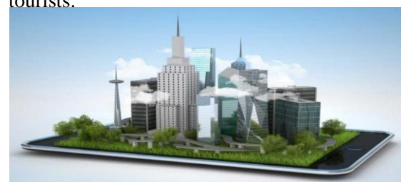
Figure 3: The concept of smart sustainable city

The notion of sustainability is derived from the need for change, in order to make people’s live better ones. It means a more attractive, inclusive and balanced city for its residents and tourists.