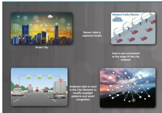
Figure 1: An overview of smart city

IoT is defined as “a dynamic global network infrastructure with self - configuring capabilities based on standard and interoperable communication protocols where physical and virtual “things” have identities, physical attributes, and virtual personalities and use intelligent interfaces, and are seamlessly integrated into the information network” [5].