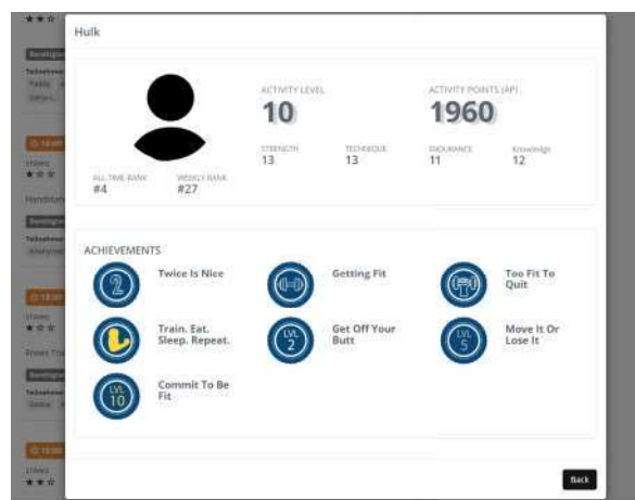
Figure 1: Profile information, after clicking on a user when booking a course or on the leaderboard

We included four different gamification elements, which are described in the following. Additionally, we implemented an option to upload profile pictures and set a username, which would be shown on the leaderboard and when booking a course (such that users could see which other users take part in the course). This was done to allow for social comparison outside of the leaderboard. The selection of gamification elements orientated on frequently used gamification elements in fitness contexts [5].