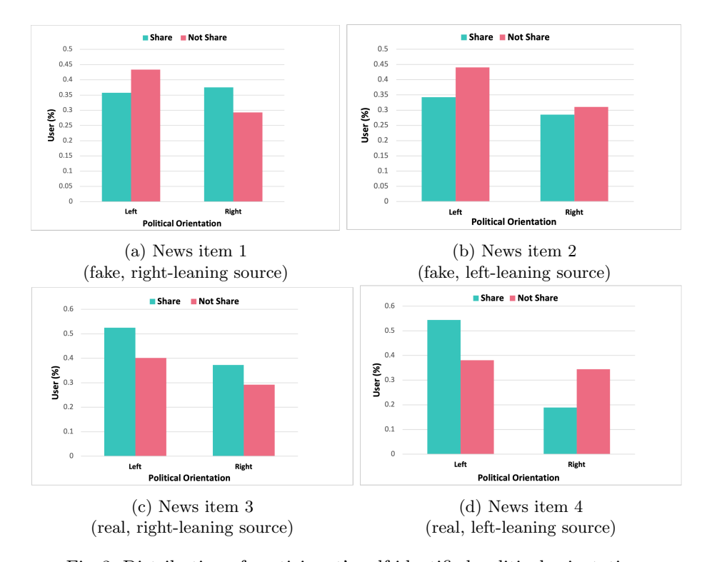
Fig. 3: Distribution of participant's self-identified political orientation.