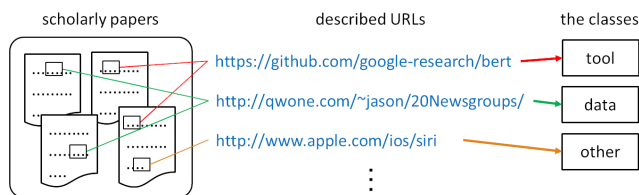
Figure 1: Design of classification task

of Penn Treebank [14] on the Open Language Archives Community (OLAC) 11 storing information on language resources 12 (e.g., corpora, dictionaries) according to Dublin Core.