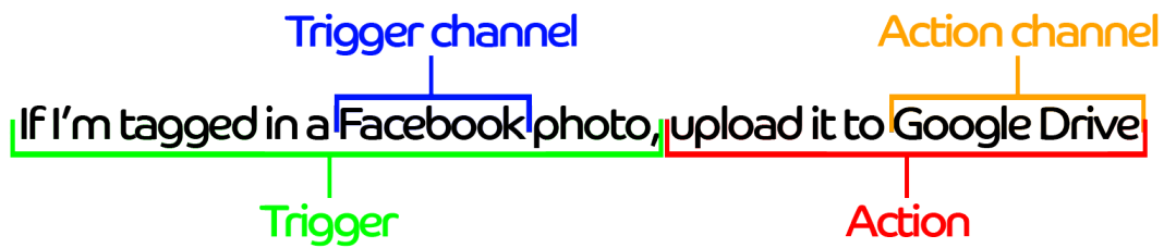
Figure 1: An example of IFTTT applet highlighting the trigger and action components