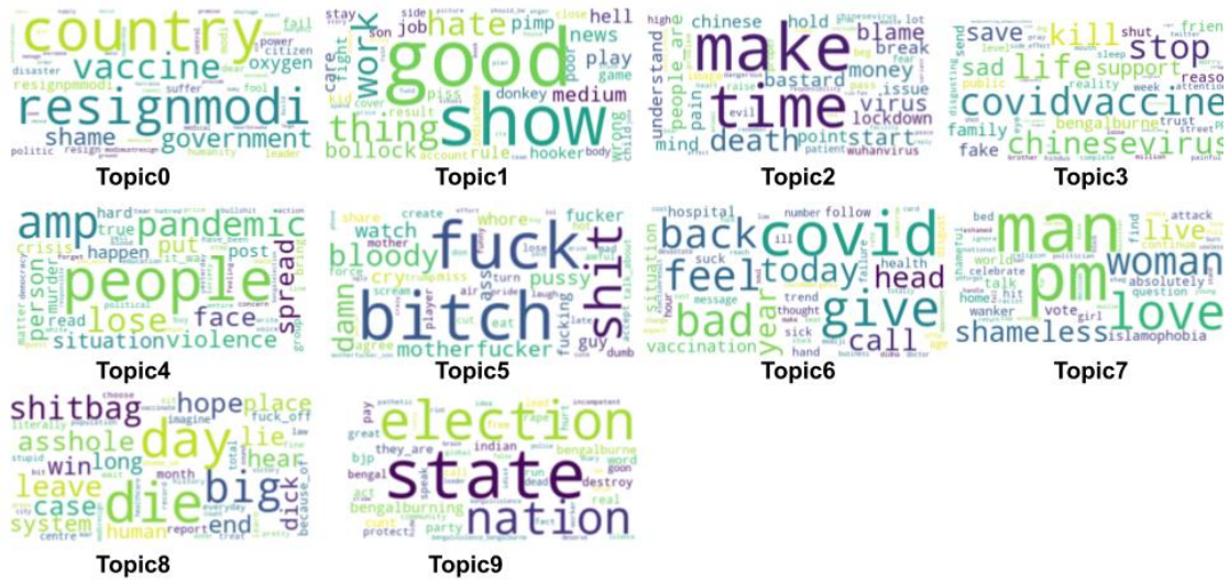
Figure 2: Optimal topics extracted from training set