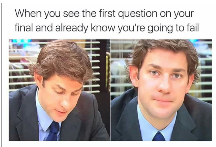
Figure 1: An example of Memotion 2.0 data. This meme has neutral sentiment and funny/little_sarcastic emotions.