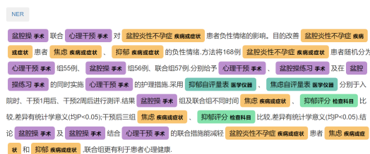
Figure 4: Interface of the Online Demo for Chinese BioNER

益腔操联合心理干预对盆腔炎性不孕症患者负性情绪的影响。目的改善盆腔炎性不孕症患者焦虑、抑郁的负性情绪。方法将168例盆腔炎性不孕症患者随机分为心理干预组56例、益腔操组56例、联合组56例, 分别给予心理干预、益腔操练习及在益腔操练习的同时实施心理干预的护理措施。采用抑郁自评量表、焦虑自评量表分别于入院时、干预1周后、干预2周后进行测评。结果益腔操组及联合组不同时间焦虑、抑郁评分比较, 差异有统计学意义( P < 0.05 ); 干预后三组焦虑、抑郁评分比较, 差异有统计学意义( P < 0.05 ); 结论益腔操及益腔操结合心理干预的联合措施能减轻盆腔炎性不孕症患者焦虑和抑郁, 联合组更有利于患者心理健康。