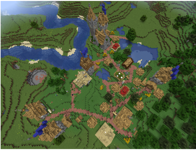
Figure 2: An aerial view of the road network in a generated settlement, showing how roads conform to the terrain and connect buildings in an organic-looking way.