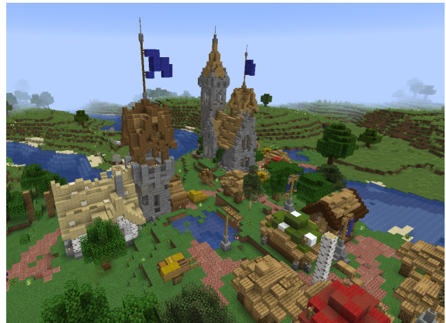
Figure 1: An example settlement generated by AgentCraft, showcasing a variety of buildings connected by roads and built from appropriate materials for the local environment.

Copyright © 2021 for this paper by its authors. Use permitted under Creative Commons License Attribution 4.0 International (CC BY 4.0).