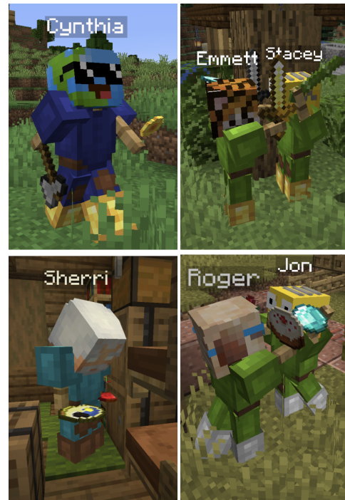
Figure 4: Several screenshots of agents as they appear in the world, carrying out their business. During the settlement generation process, agents visibly walk from place to place, collect resources, and interact with other agents.