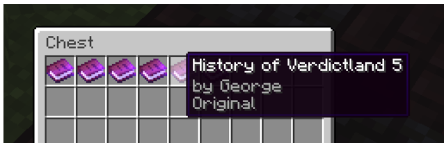
Figure 6: A group of generated Chronicles for a settlement procedurally named Verdictland.

entry this year; consequently, we leave per-agent diary generation to future work.