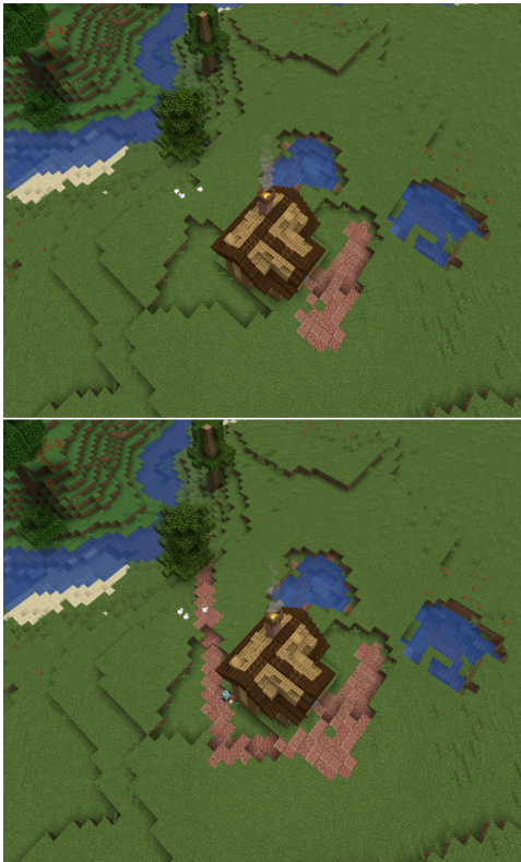
Figure 3: The initial road network can't be extended in a straight line to reach the nearest tree, so we first find a route around the building, extend the road network slightly, and construct a straight-line road to the tree from the new extension.

The combination of these checks and algorithms is computationally more expensive than some simpler road network generation algorithms, but results in an iterative and organic road system that builds on top of itself, effectively replicating real-life road systems—particularly those found in older cities with less-than-modern city-planning origins.