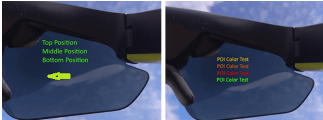
Figure 5: An illustration of the textual description positional options and the directional arrow (left) and color options (right).