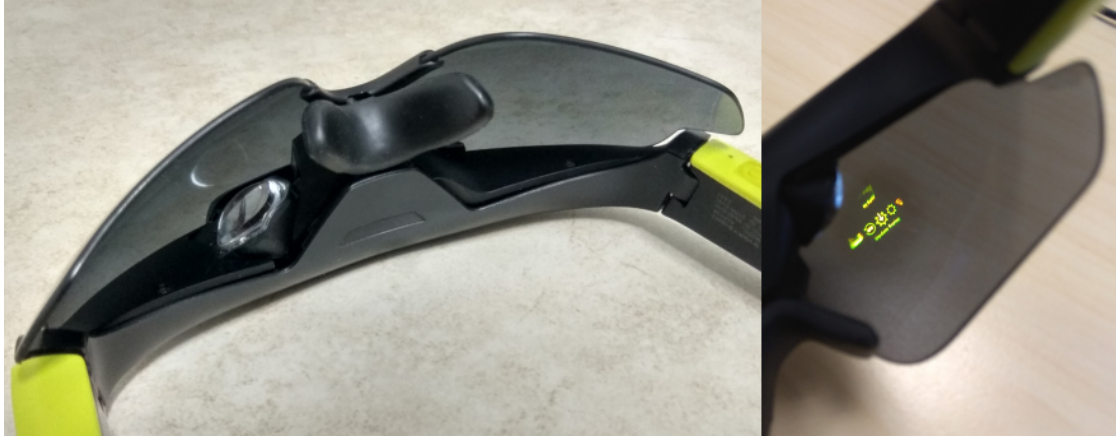
Figure 2: A rear view of the monocular augmented reality smart glasses with the optical lens; the smart glasses live display in action (left to right).