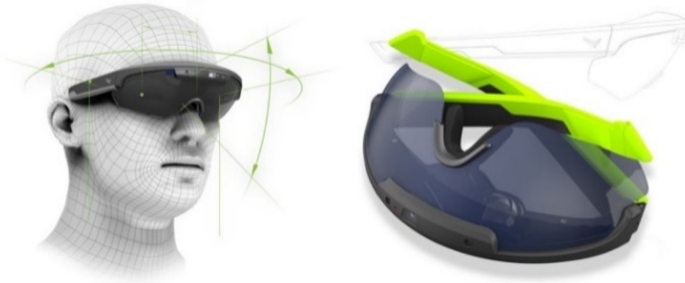
Figure 1: The EverySight “Raptor” smart glasses used — the glasses and an illustration of a user wearing them.

augmented reality smart glasses, we decided to focus on this aspect, planning a larger scale visiting path. The paper presents the design and implementation of the system and lessons learned during the design and initial evaluation of the system as a navigation aid in an urban setting.