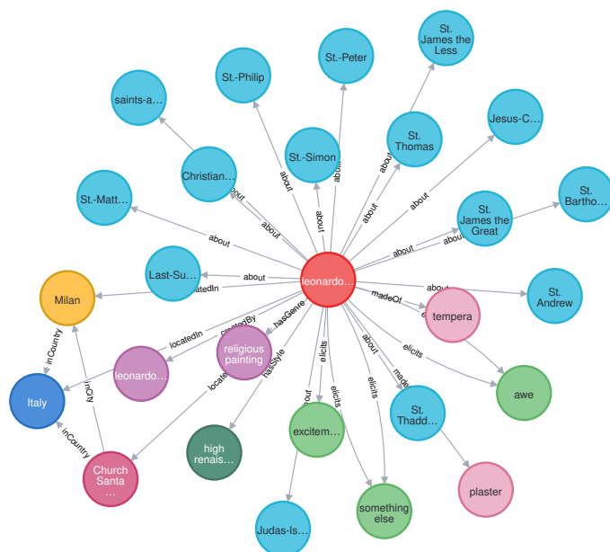
Figure 1: Subgraph related to “The Last Supper”. It contains information including style, genre, people depicted, and so on.

ways based on text prompts. On the other hand, image captioning can generate meaningful descriptions of artworks. For this purpose, methods based on natural language processing are crucial and will be explored. Unfortunately, image captioning systems that work well with natural images often fail when asked to generate output from an art image because they lack the richness and depth that a historical background would provide. This is confirmed by the study conducted by Cetinic et al. [14]. Developing a system that can mimic a human expert is a long-term goal of this community research line.