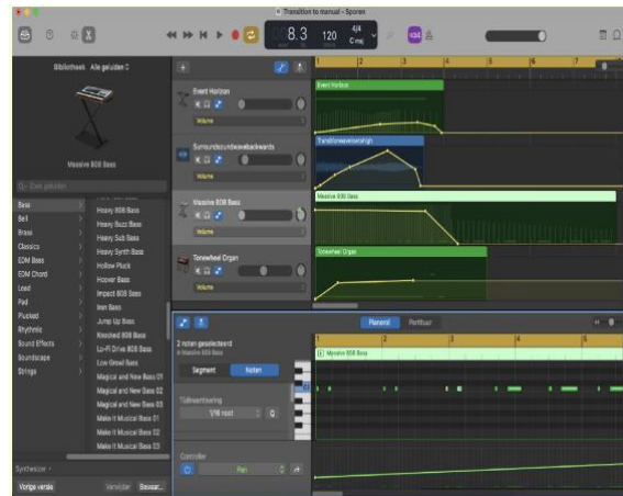
Figure 1: Creating soundscape using a sound design tool

[12]. Our case at the 'Interactive audio design' master course at the Faculty of Industrial Design Engineering provided some excellent examples of the possibility of forming soundscape as a take-over request and new interaction about how it designs driving experience. Students designed context-relevant soundscapes for automated vehicles, including take-over requests. Students received the following scenario description on which they had to base their sound design: "The driver is around 35 years old and runs a startup company. The vehicle is highly automated. The vehicle is a B-segment-sized, commonly described as a small car with an enormous volume in Europe (i.e., Toyota Yaris, Renault Clio)." Students made a persona based on the scenario description and analysed scenarios which need sound for interaction and designed a soundscape for scenarios using a sound design tool.