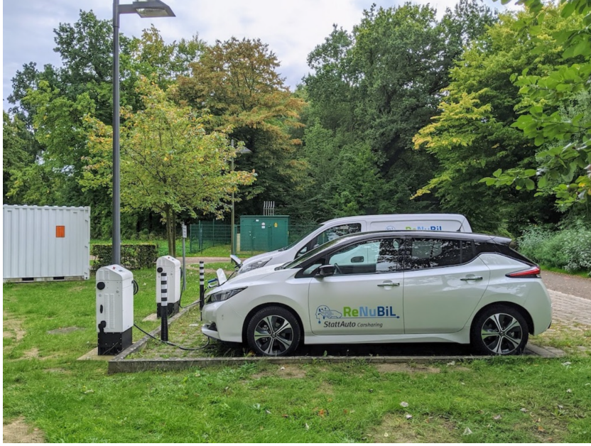
Figure 1: ReNuBiL living lab on University of Lübeck's campus with two electric cars, two bi-directional charging stations, and stationary battery container

enable bookings we have already confirmed to users (safeguarding bookings). To this end, users have to provide their requested range with each booking. Our second priority is to utilize both, the buffer as well as the car batteries in order to avoid exceeding the power consumption limit (peak shaving). Our third priority is to keep the cars available for short notice bookings, i.e. keep the cars charged as much as possible.