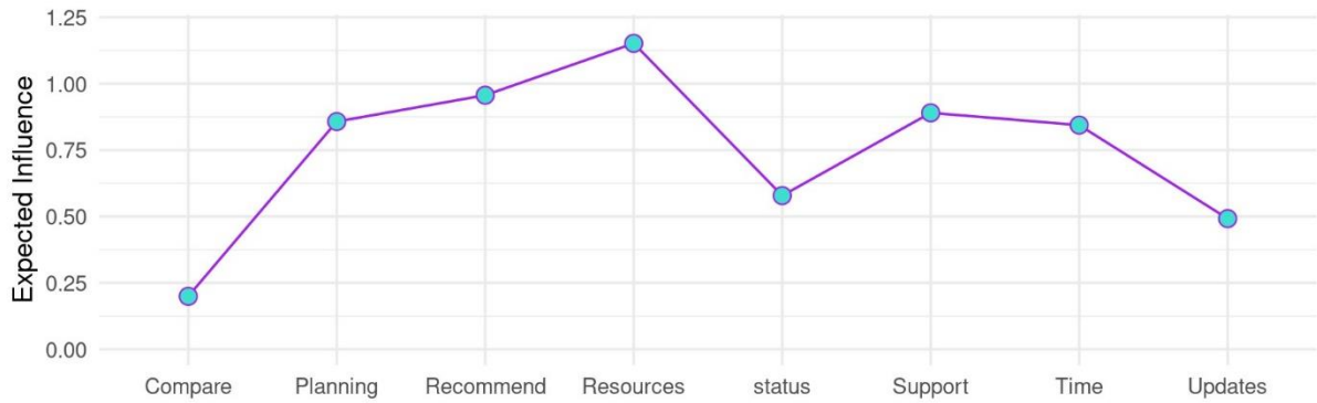
Figure 3: Expected influence centrality for each of the measured constructs

The expected influence centrality measures plot shows the features that drive the interest in other features from LA. As we can see, resources and recommendations are the most central features that have the highest expected influence on other features, followed by help planning and support. Interestingly, tracking, updates, and comparisons are the least central features that are less likely to kindle students' interest in LA.