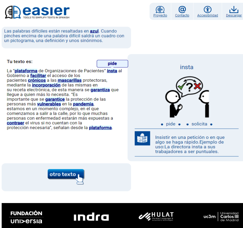
Figure 1: User Interface of the EASIER Tool.