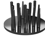
(b) 3D model of the experiment.